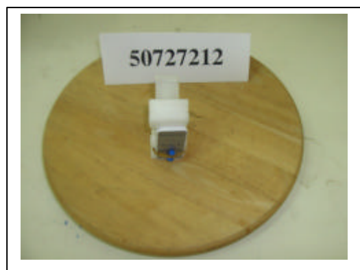
Radiated Open Site Test Set-up