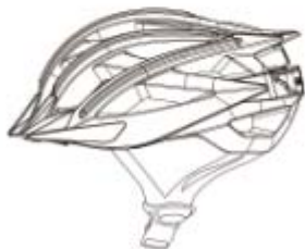
LIVALL Smart Safety Helmet