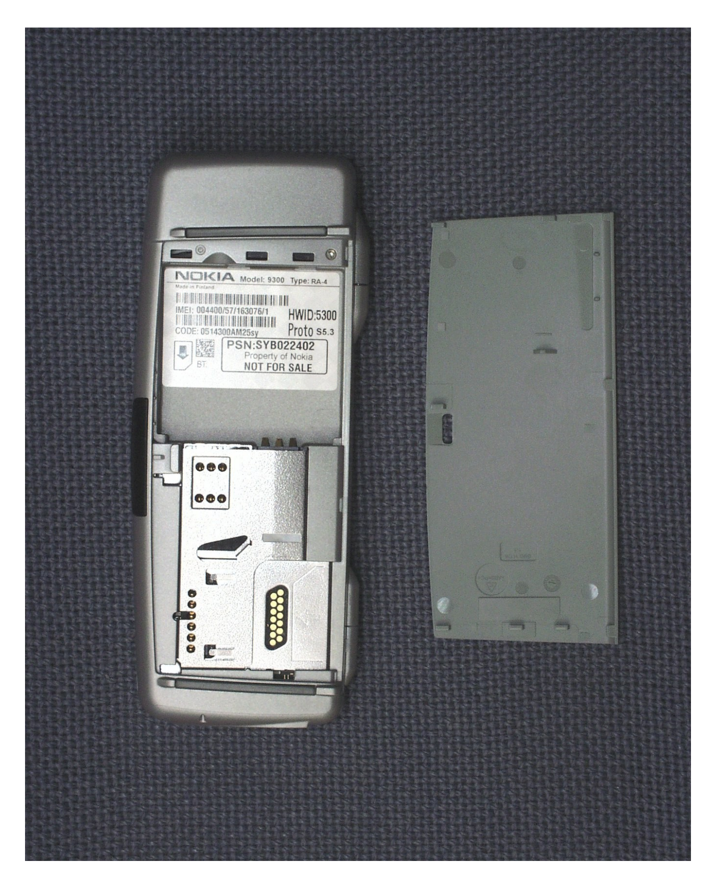
Exhibit 03: External Photos

FCC ID: PYARA-4 IC: 661V-RA4 Copyright © 2005 Nokia. All rights reserved.