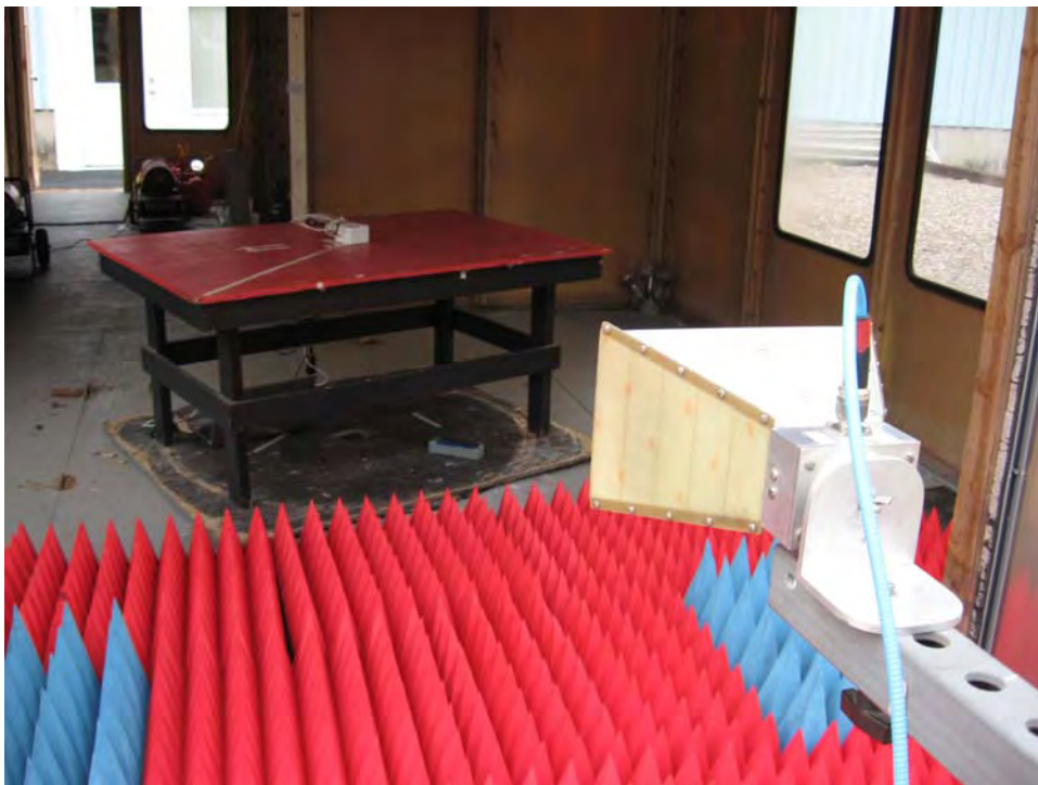
1 GHz – 10 GHz, Vertical Polarization