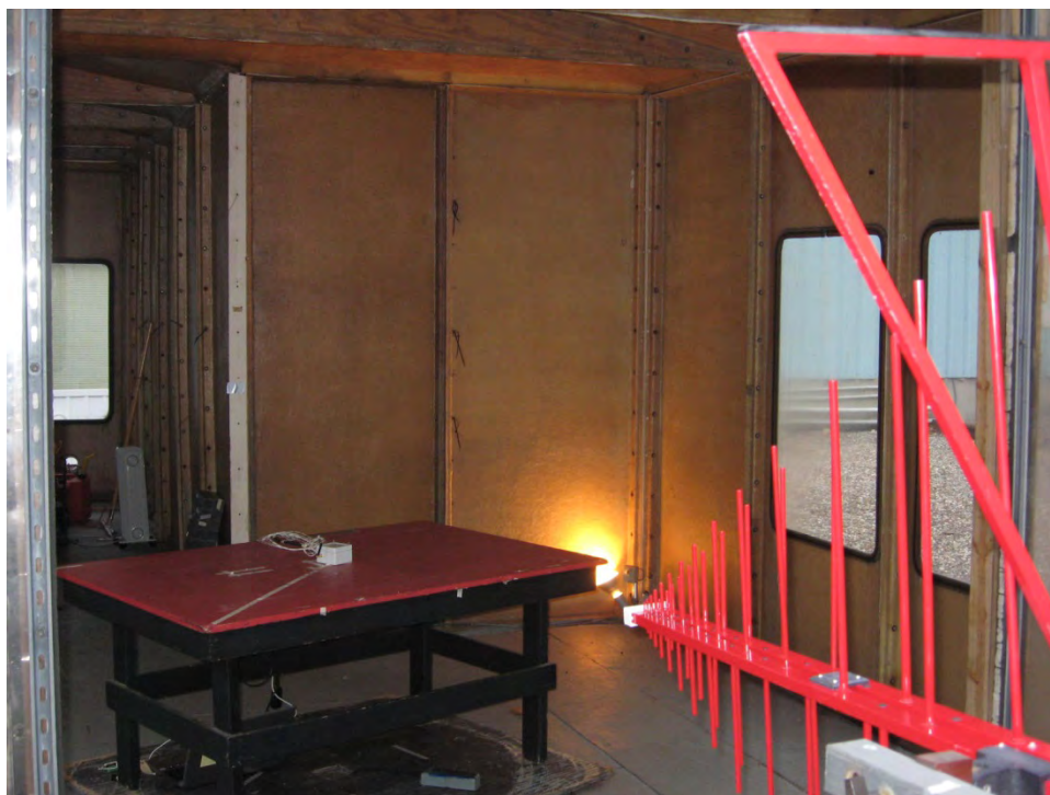
30 MHz – 1 GHz, Vertical Polarization