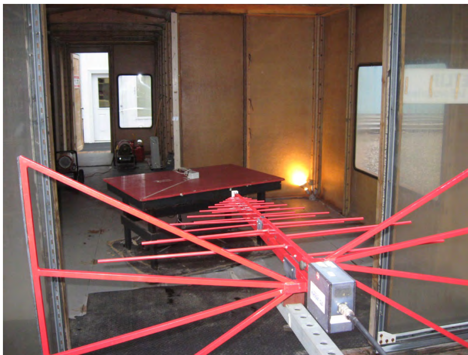
30 MHz – 1 GHz, Horizontal Polarization