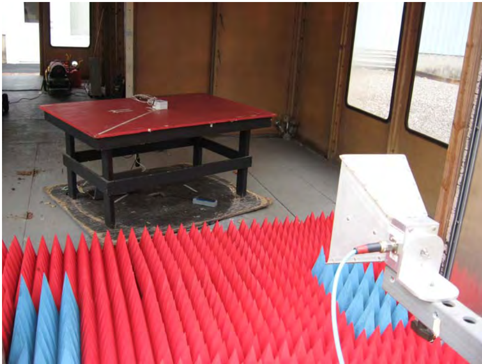
1 GHz – 10 GHz, Horizontal Polarization