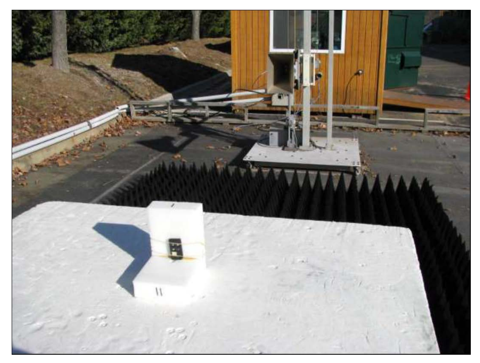
Photograph 2: Radiated Testing - Expanded View