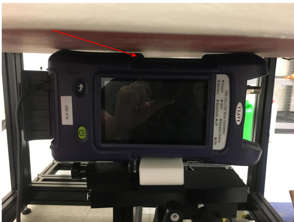
Left side Position