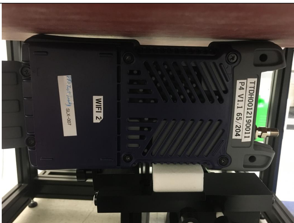
Right side Position