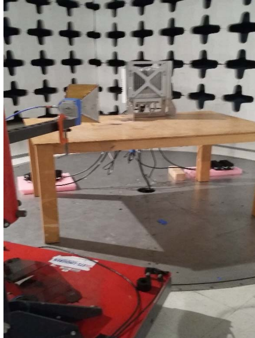
Radiated Spurious Emissions 1GHz > < 18GHz