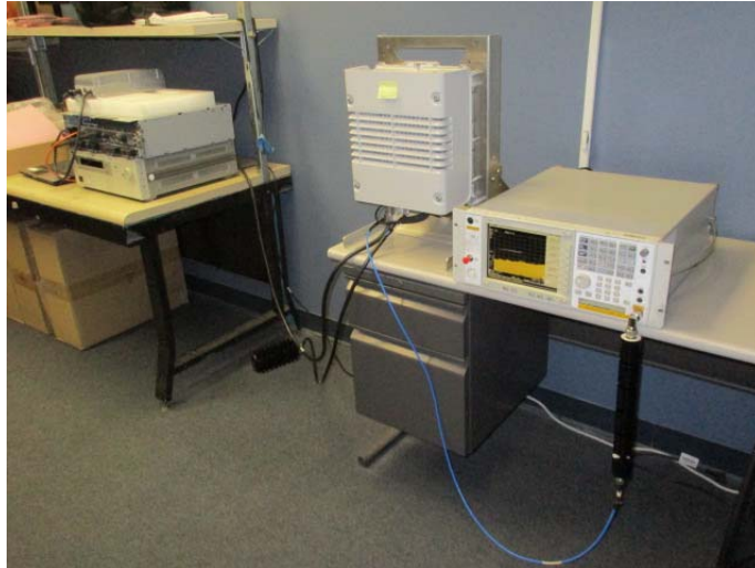
Conducted Port Testing