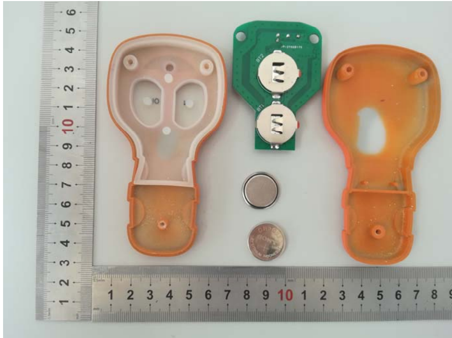
EUT – Cover off View-2