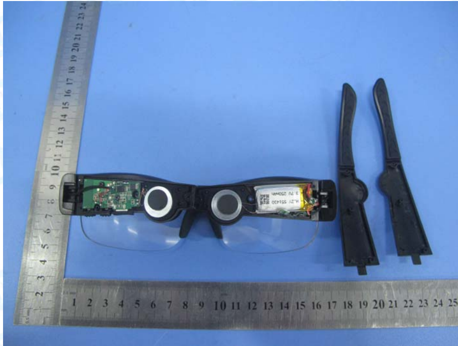
Photo 9 Appearance of PCB