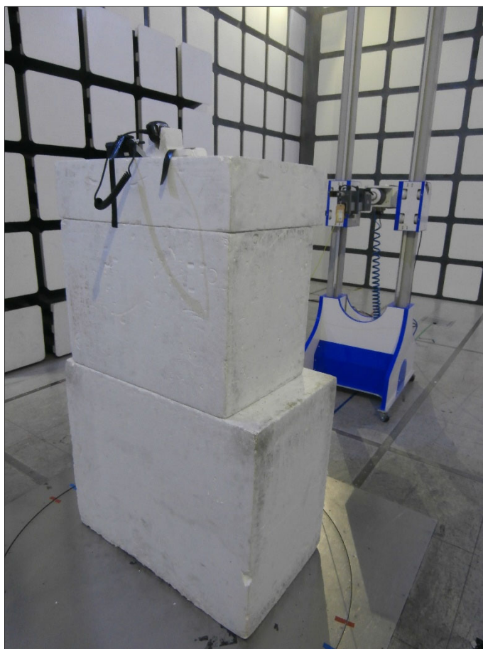
Figure 28 - 18 GHz to 25 GHz - Z Orientation