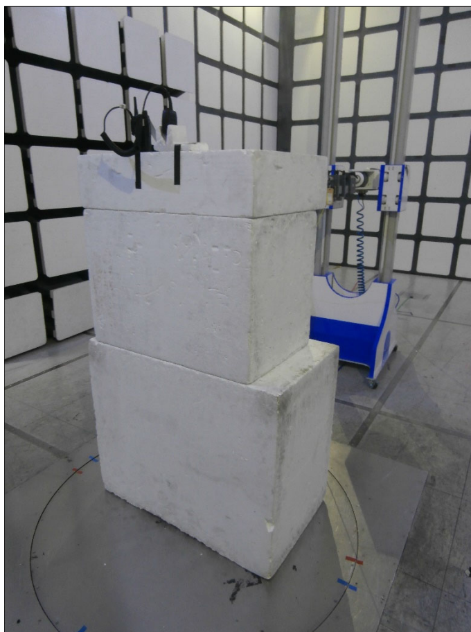
Figure 25 - 18 GHz to 25 GHz - Y Orientation