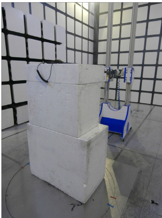
Figure 22 - 18 GHz to 25 GHz - X Orientation