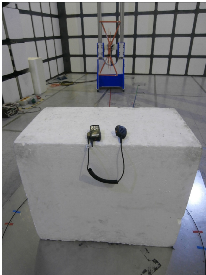
Figure 20 - 30 MHz to 1 GHz - X Orientation