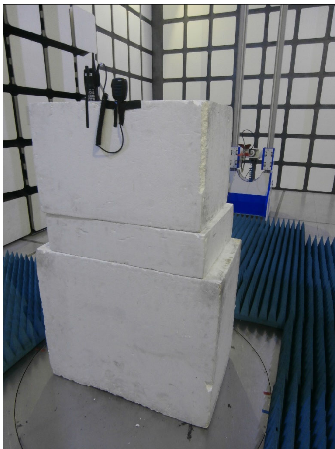
Figure 24 - 1 GHz to 18 GHz - Y Orientation