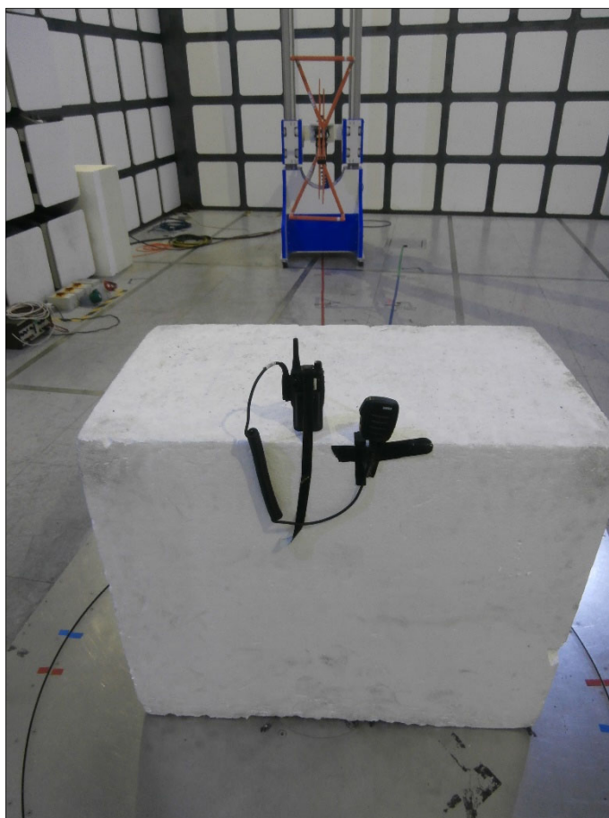
Figure 23 - 30 MHz to 1 GHz - Y Orientation