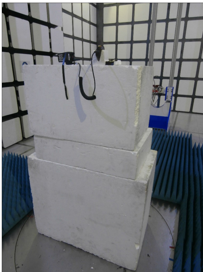
Figure 27 - 1 GHz to 18 GHz - Z Orientation