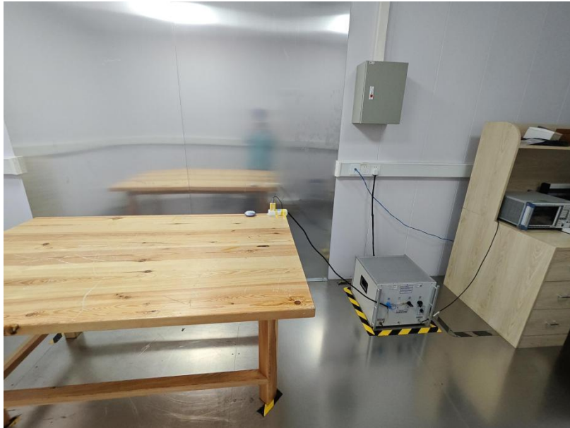
Radiated Emissions From 30M-1GHz