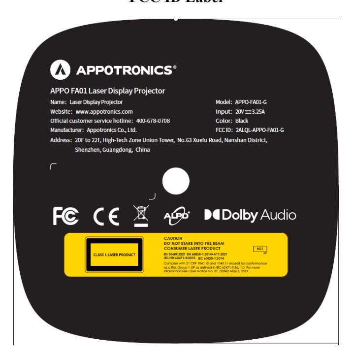
FCC ID Label Location Information