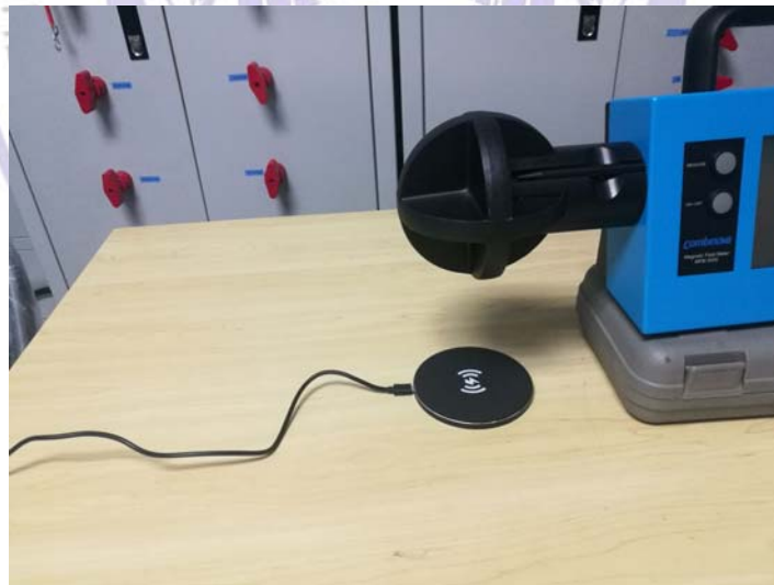
Test Setup Photo