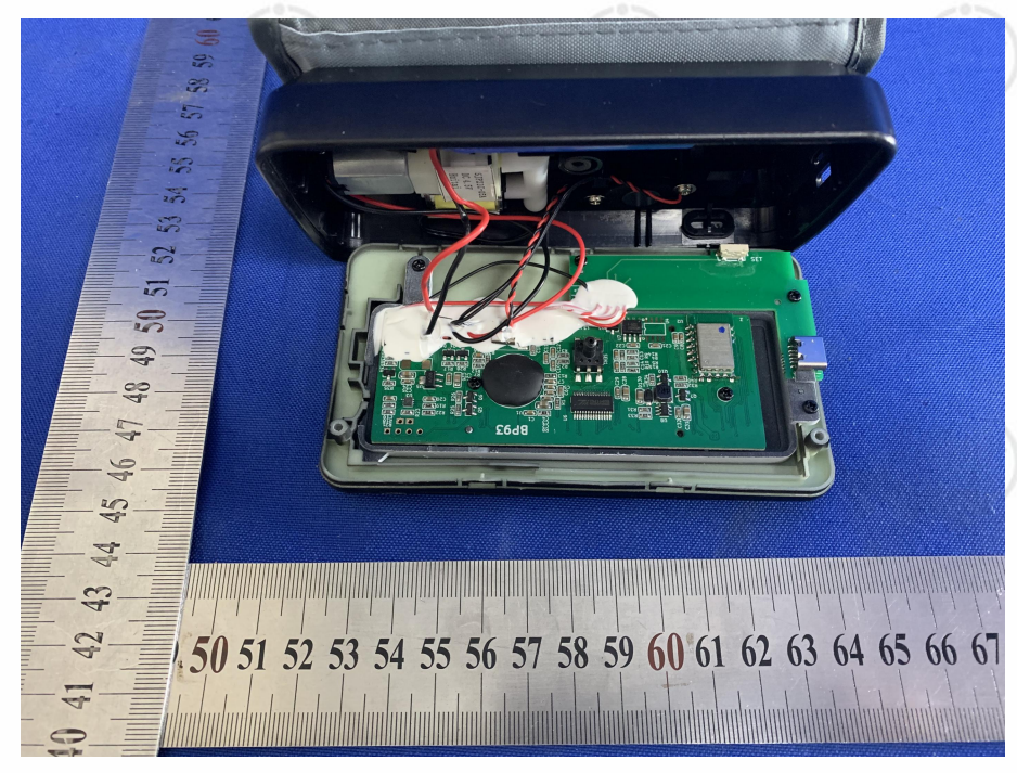
View of Product-12