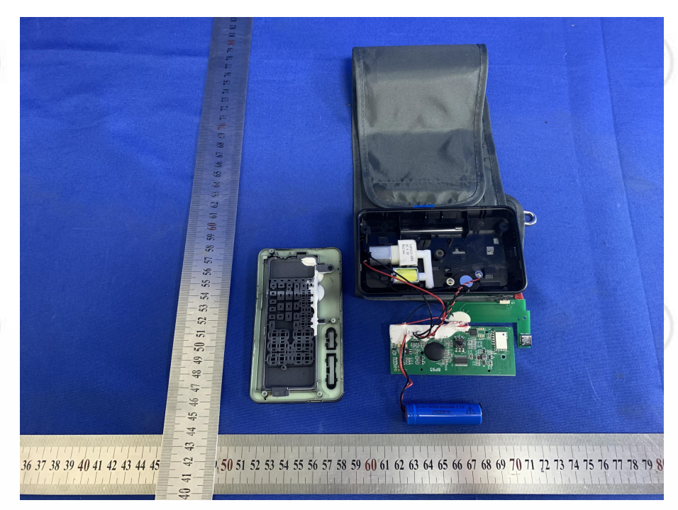
View of Product-13

Report No.: EED32P82069601 Page 45 of 49