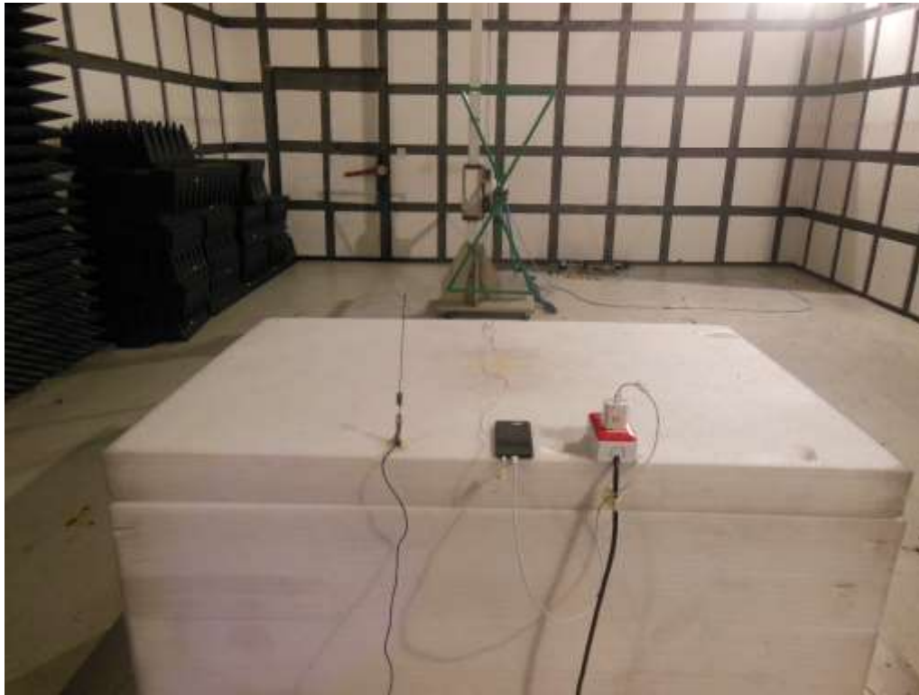
Radiated Spurious Emission (30MHz to 1GHz)