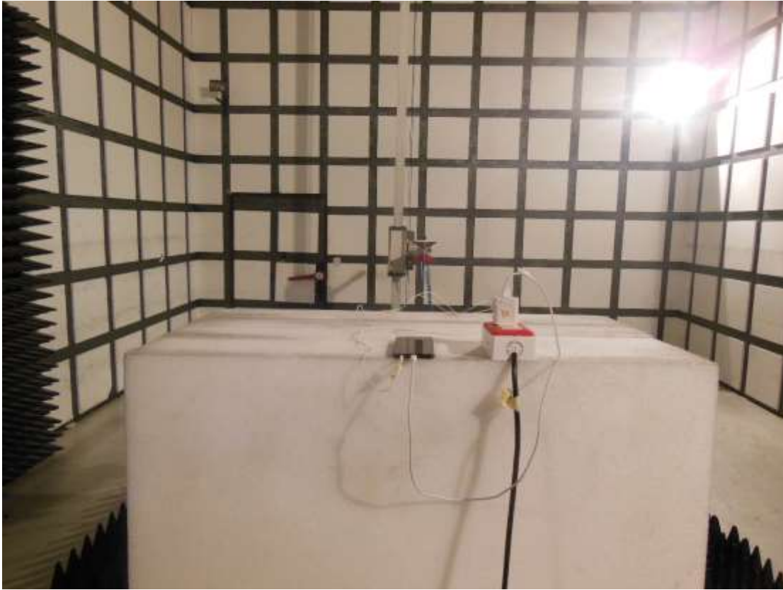
Radiated Spurious Emission (1GHz to 18GHz)