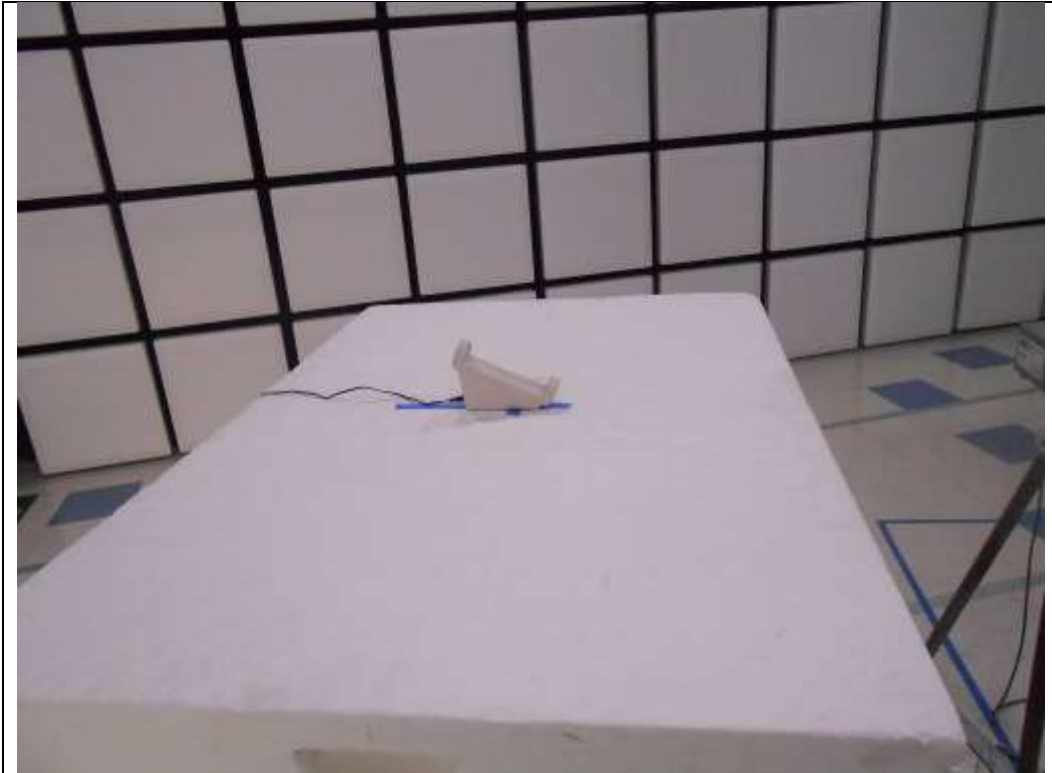
RF Radiated #2