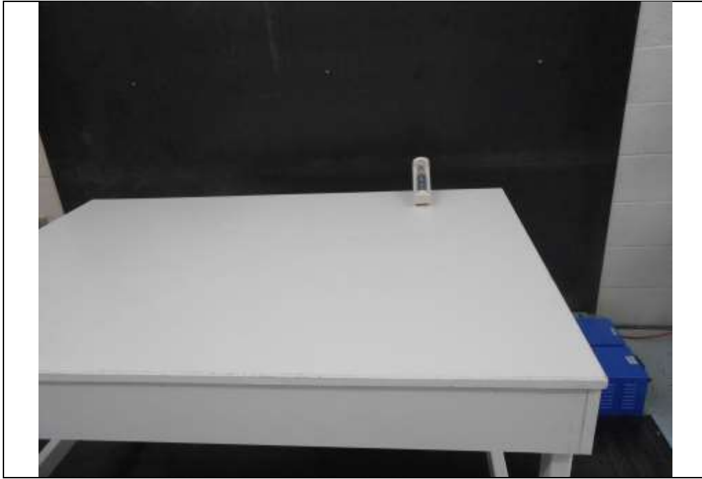
RF Conducted #2