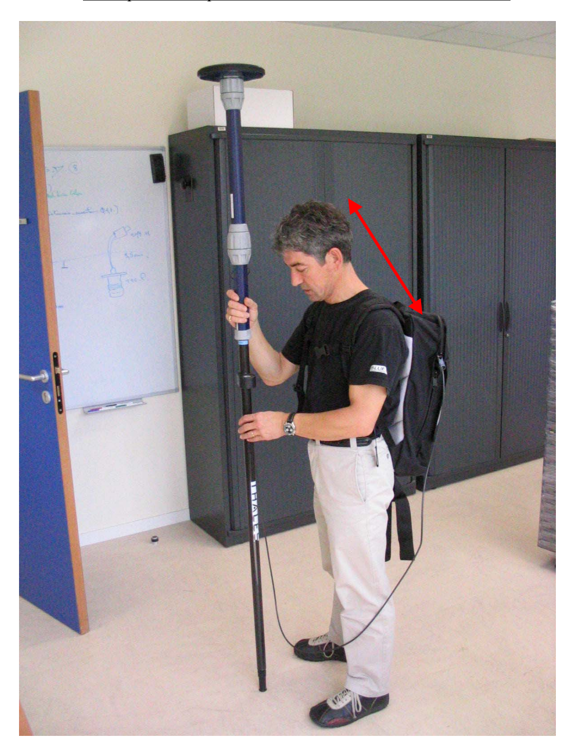
RF Exposure – Separation Distances For Device in Back Pack

Distance to body: From 5 cm to 10cm Distance to head: from 30cm to 50 cm