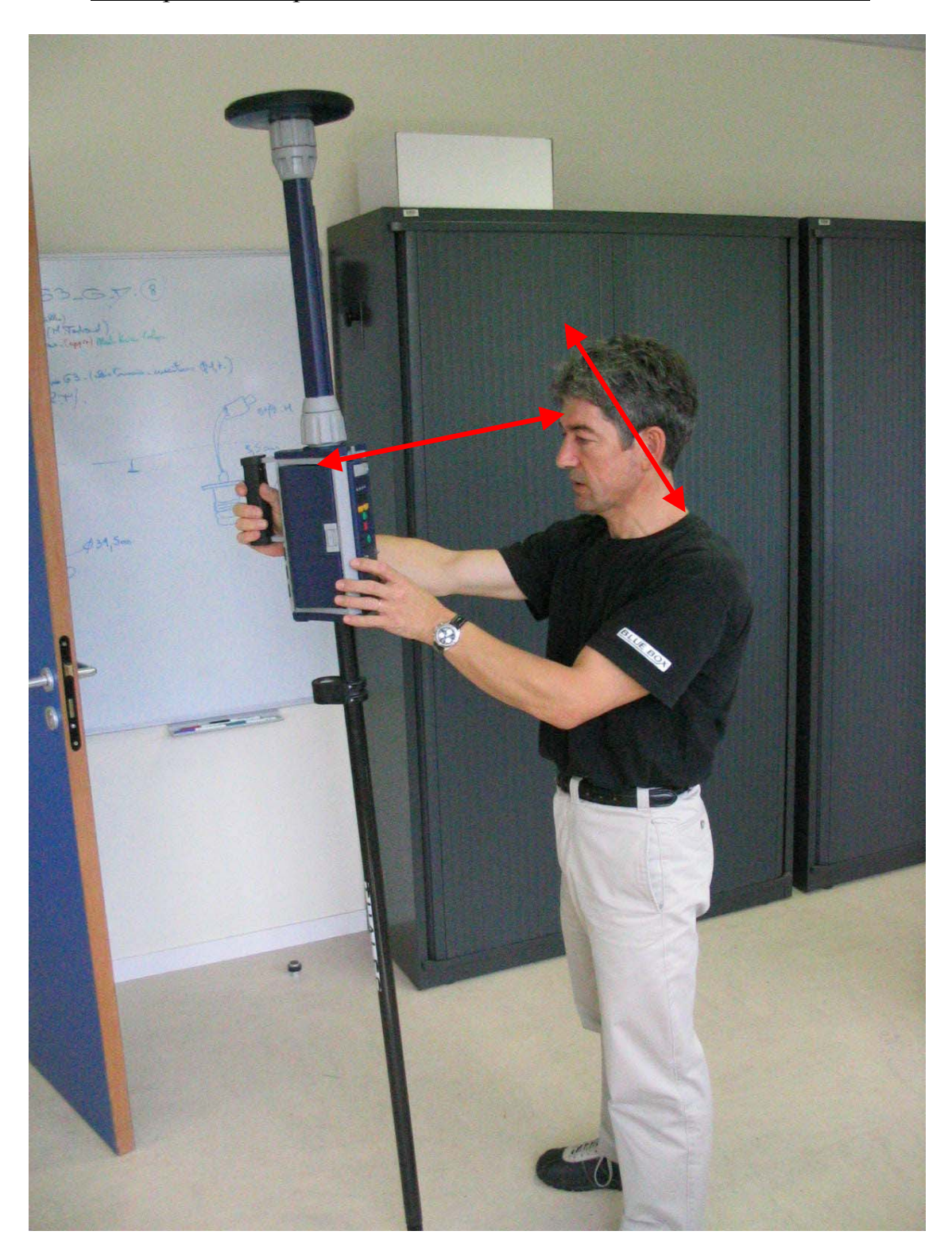
RF Exposure – Separation Distances For Device When Pole Mounted