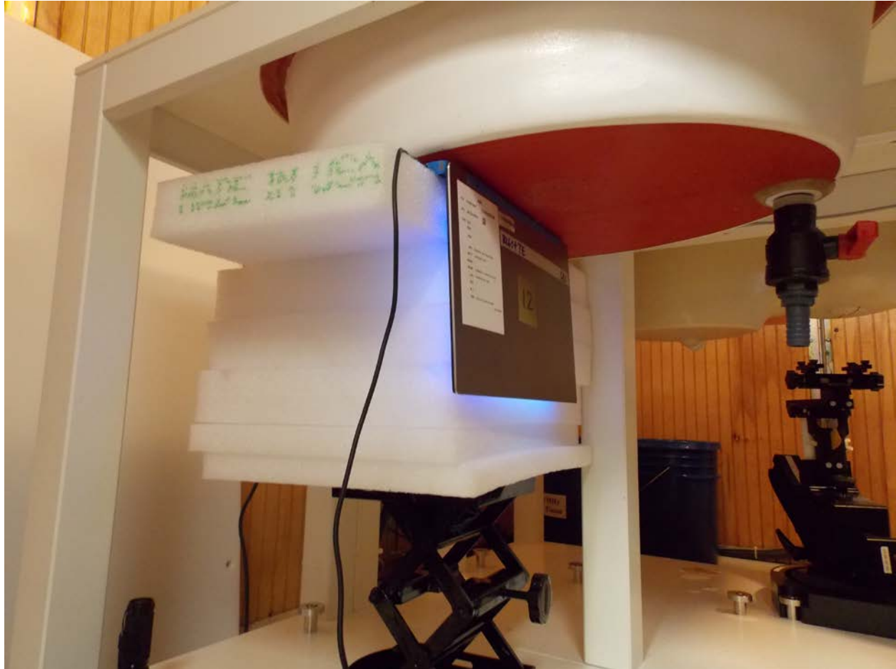
Test Position Laptop Mode 0 mm Gap