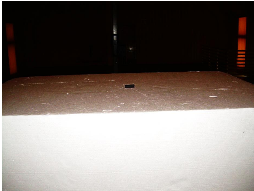
Photograph 6: Back View Radiated Emissions – Above 1000 MHz