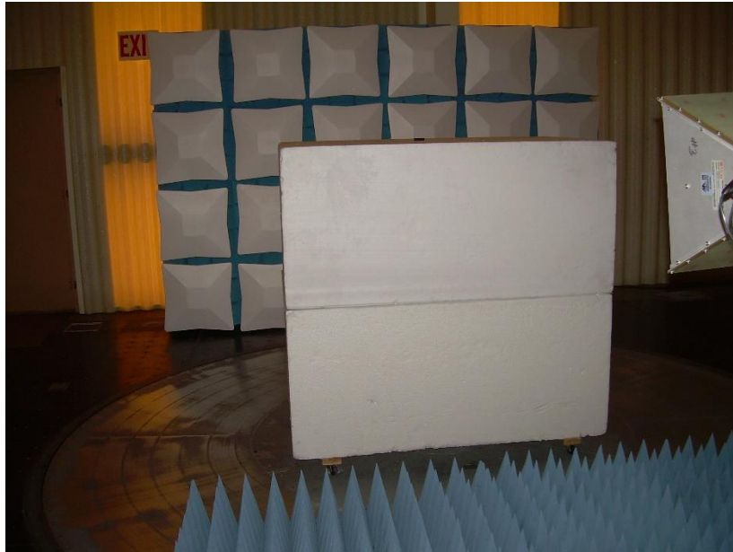
Photograph 5: Front View Radiated Emissions – Above 1000 MHz