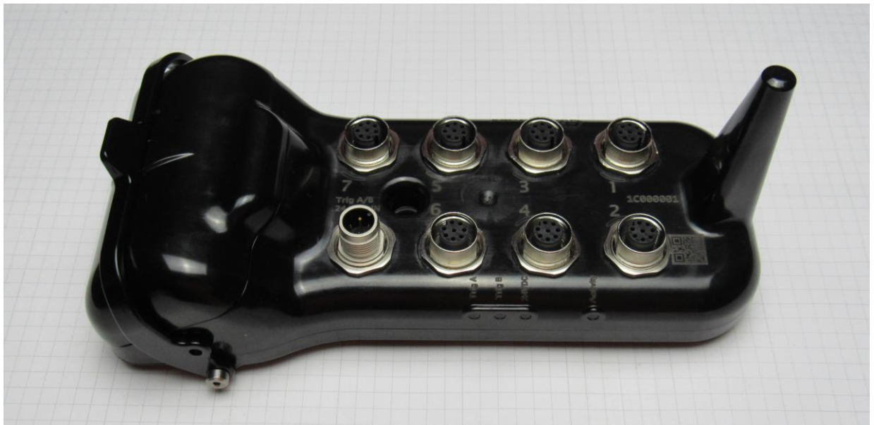
Fully assembled HUB with Battery Power Module installed. Grid pattern is 5mm.