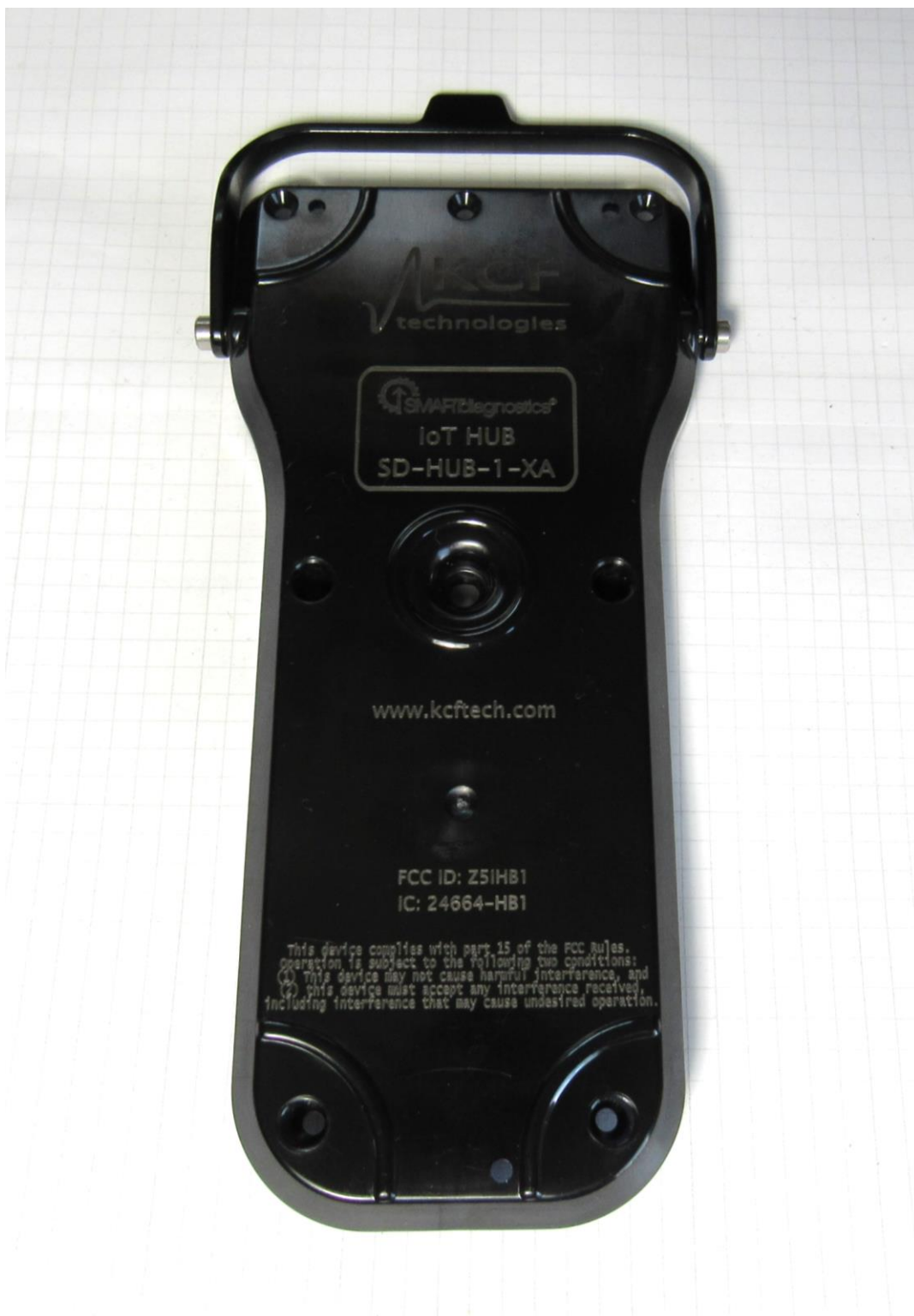
Bottom of "HUB Base". Grid pattern is 5mm.