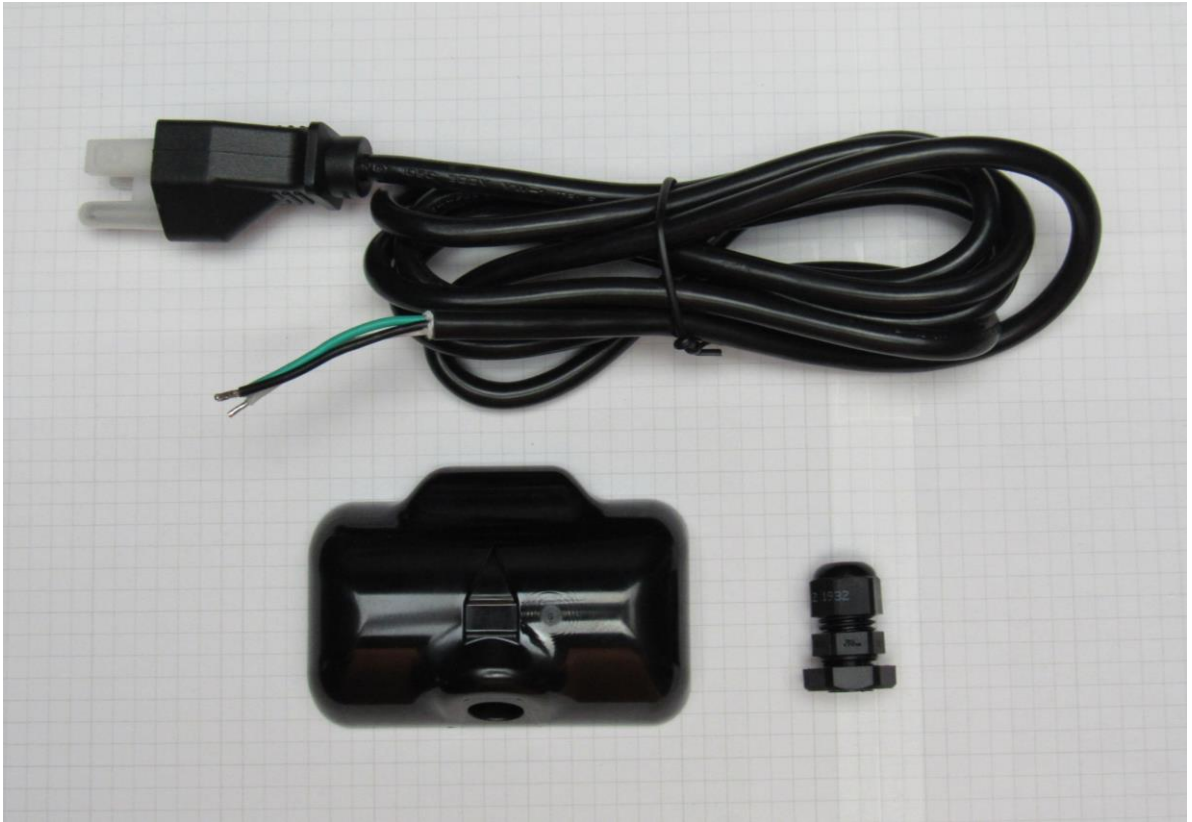
“AC Power Module” parts. Grid pattern is 5mm.