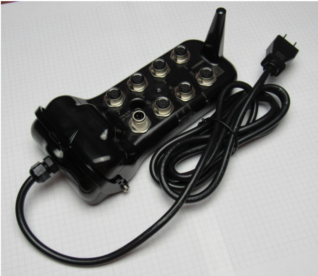
Fully assembled HUB with AC Power Module installed. Grid pattern is 5mm.