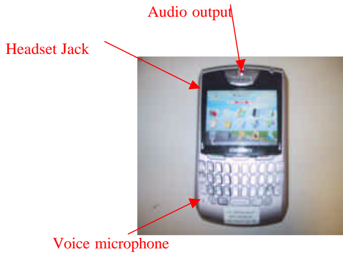
Figure E1: BlackBerry Wireless Handheld