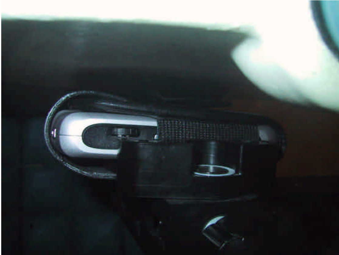
Figure E6. Body worn with holster configuration (back)