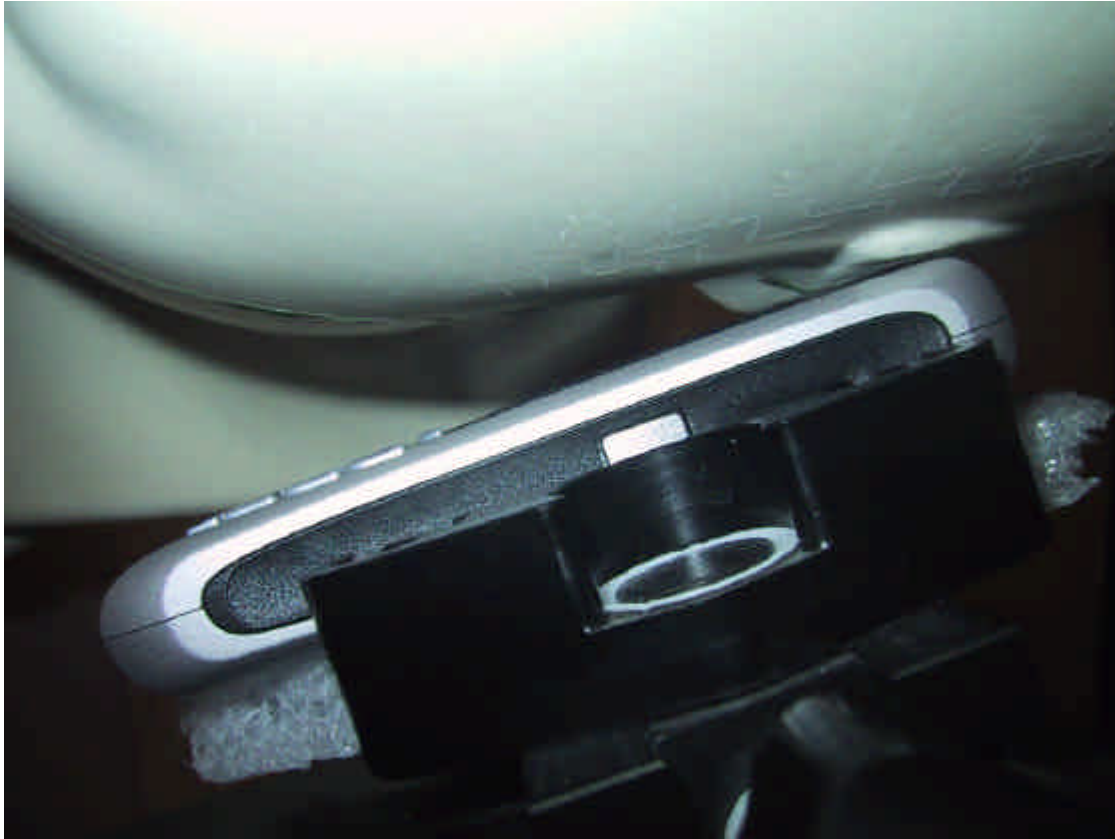
Figure E5. Left tilt position