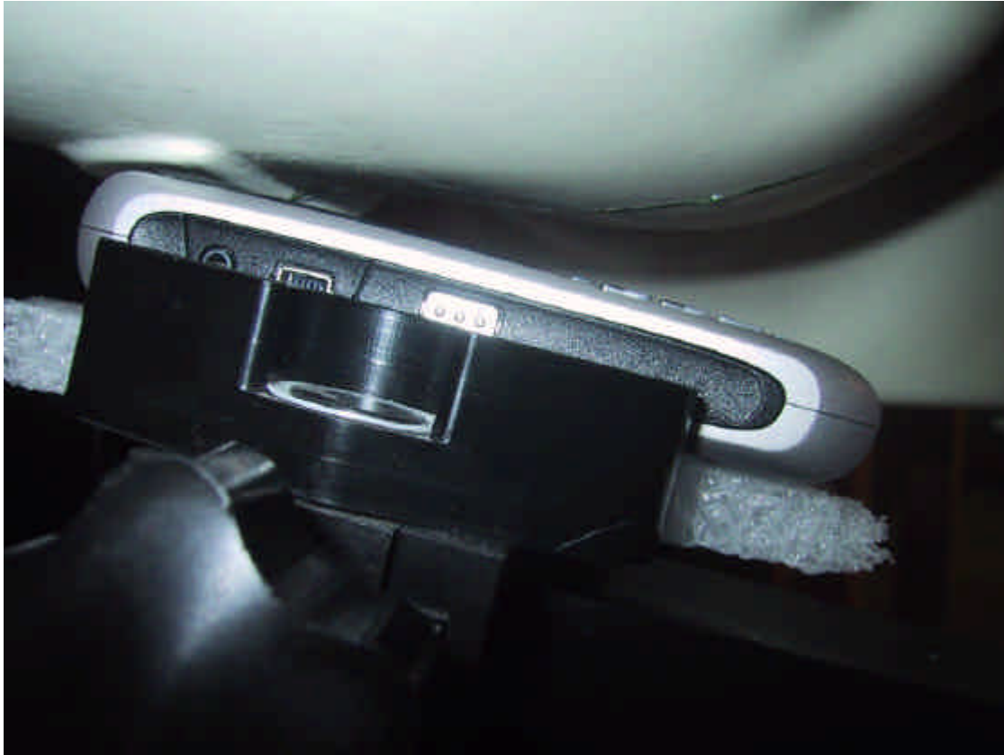
Figure E3. Right tilt position