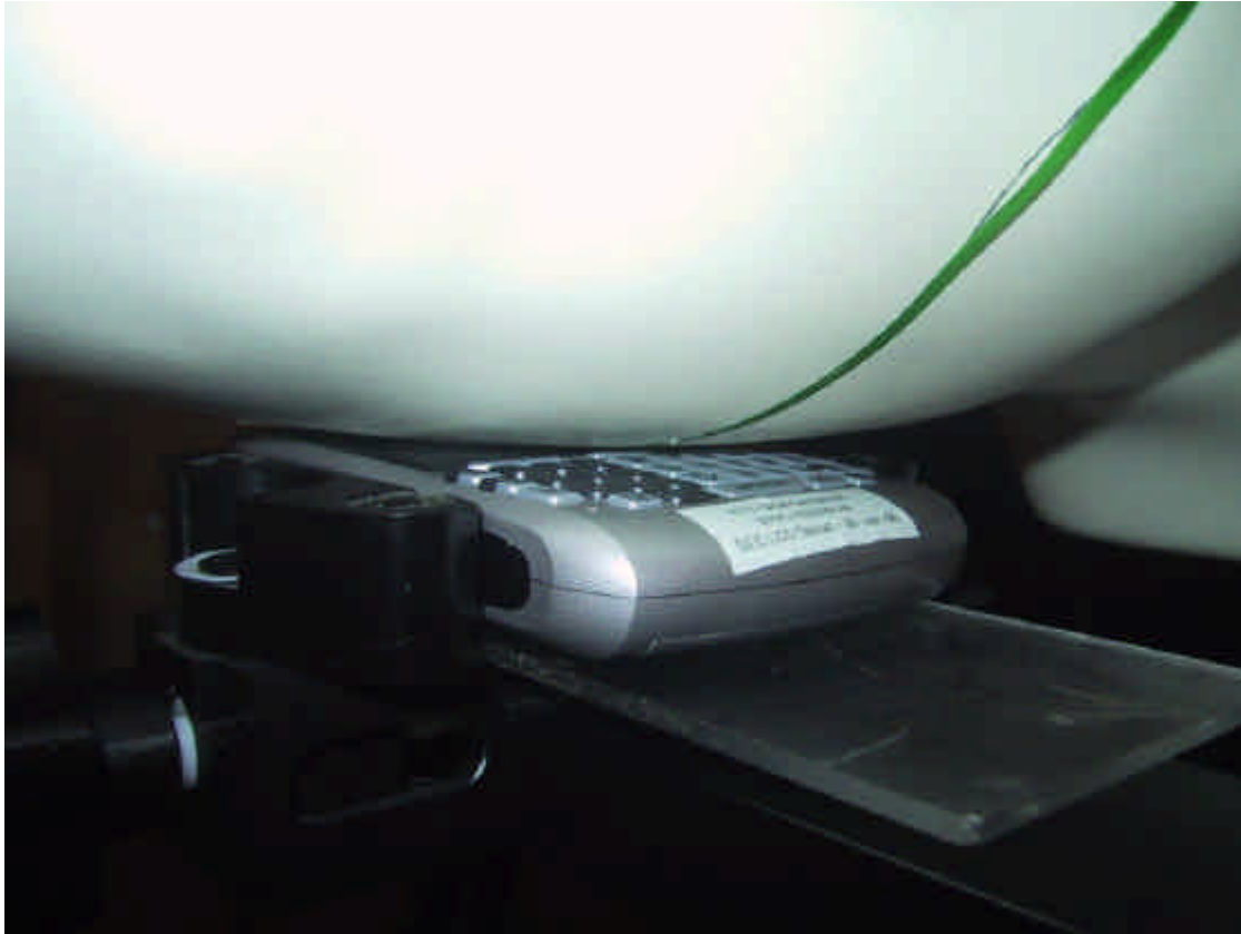
Figure E2. Right touch position