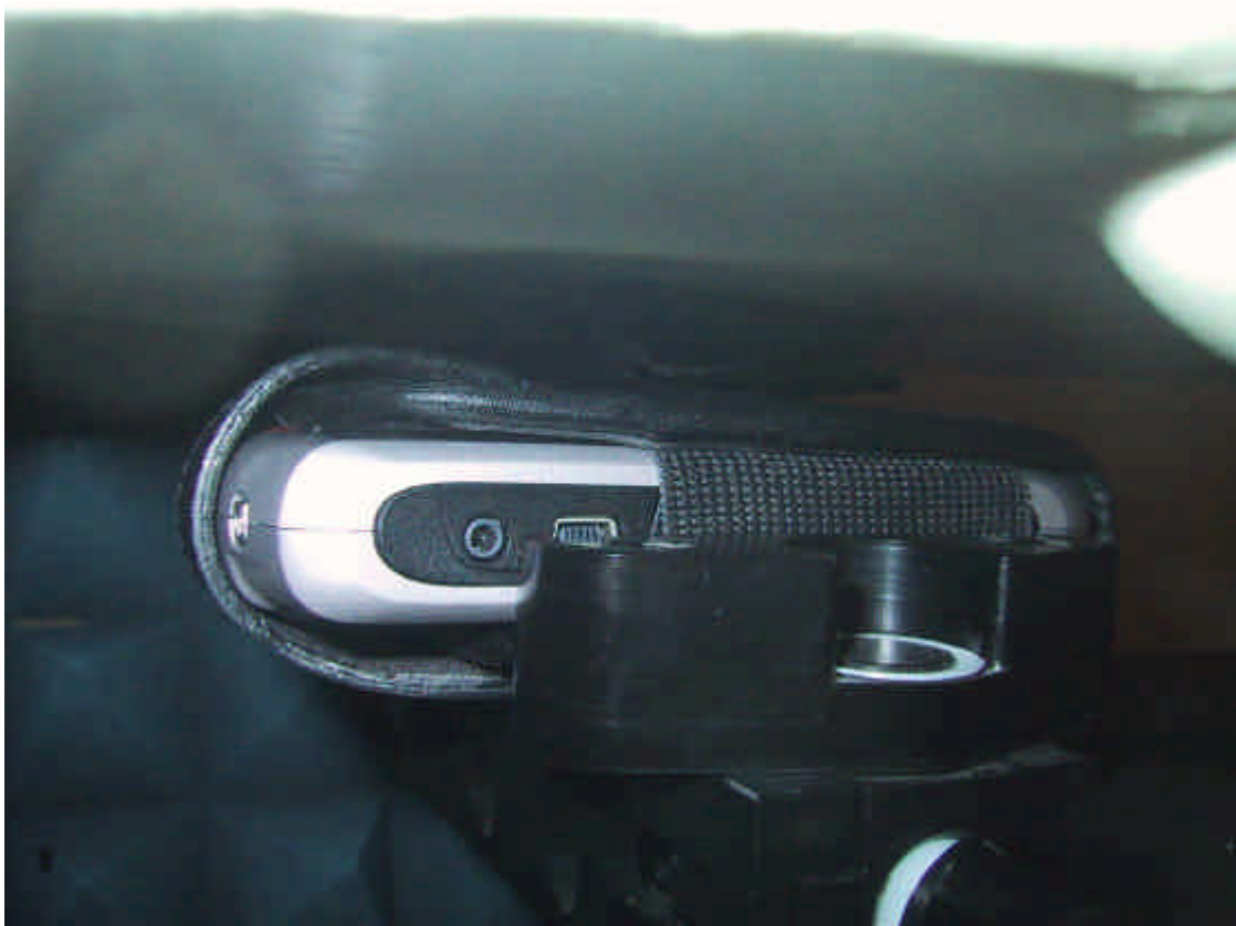
Figure E7. Body worn with holster configuration (front)