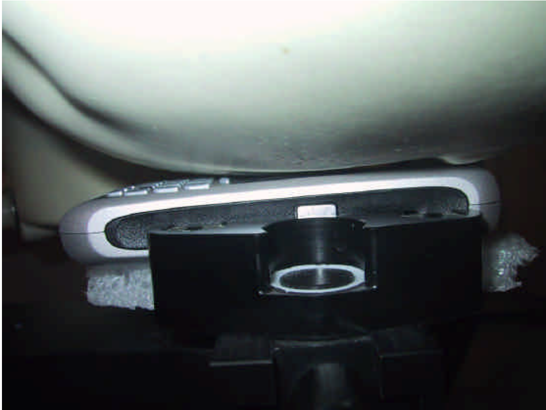
Figure E4. Left touch position