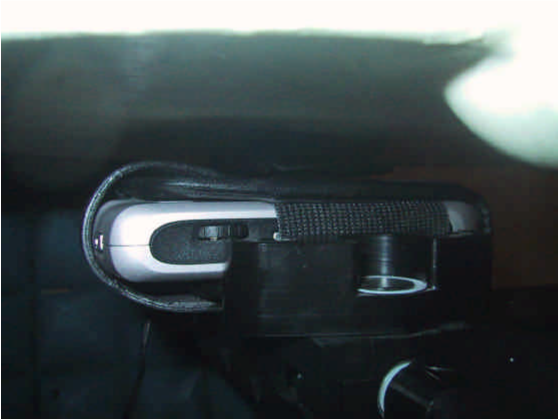
Figure E8. Body worn with holster configuration (BT ON & headset attached)