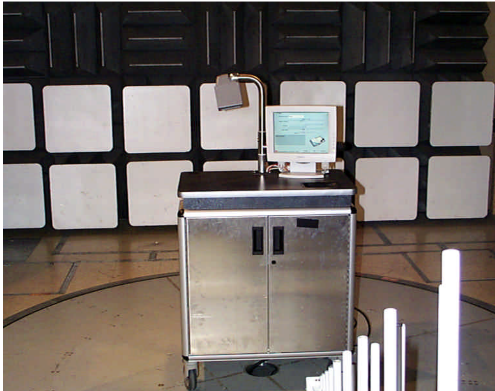
Radiated Emissions (30 to 1000MHz)