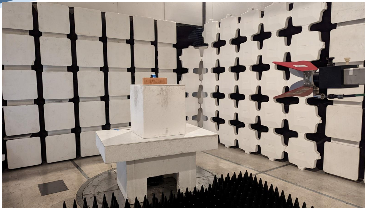
Spurious Emissions 1-18GHz