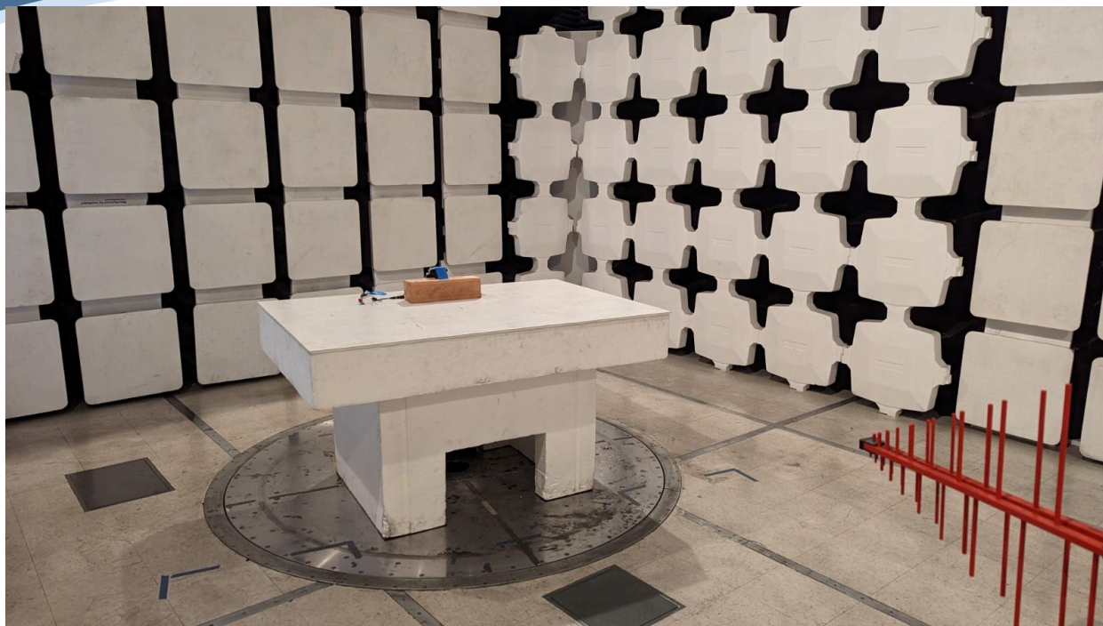
Spurious Emissions 30MHz to 1GHz