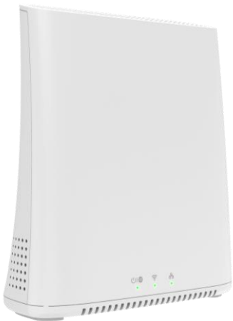
Figure 1: Front Panel