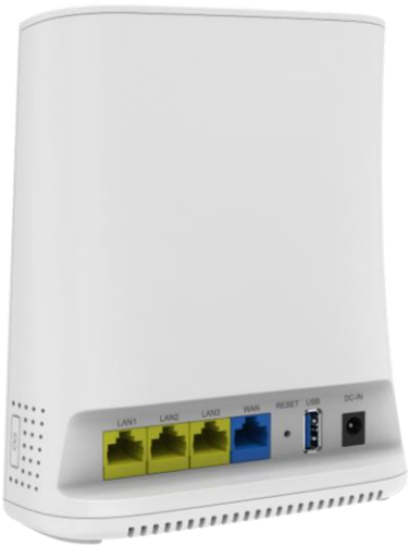
Figure 2: Back Panel