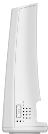
Figure 3: Back Panel