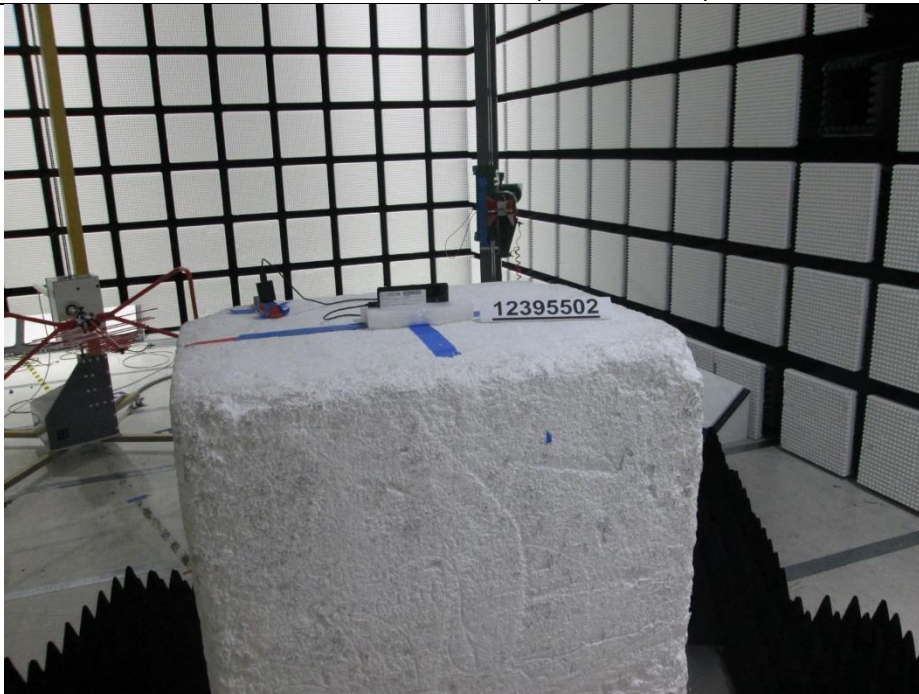
RADIATED BACK PHOTO (ABOVE 1 GHz)