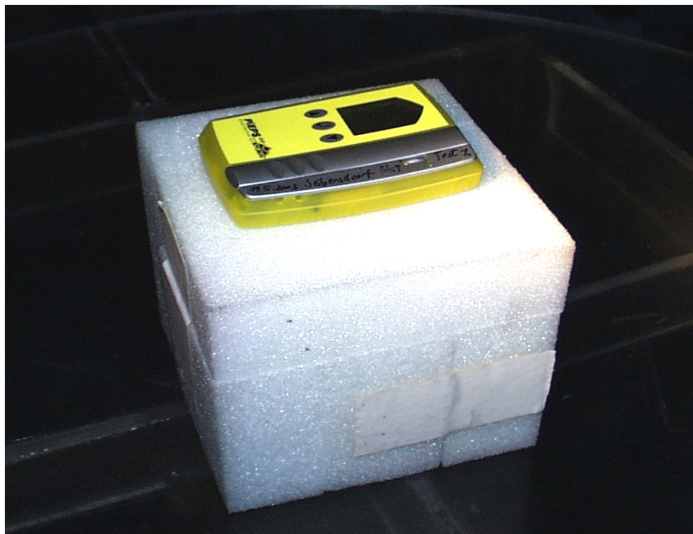
Pieps DSP , detailed