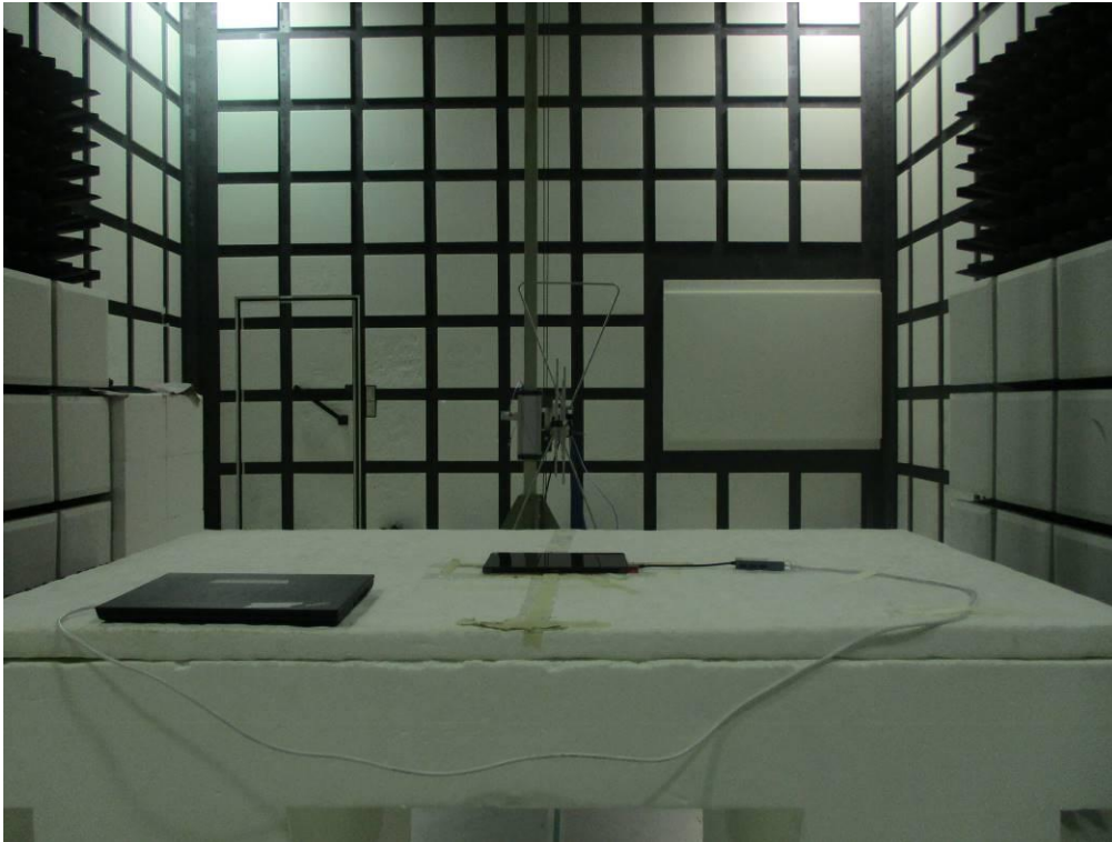
Conducted Setup Photo (Measurement at Antenna Port)