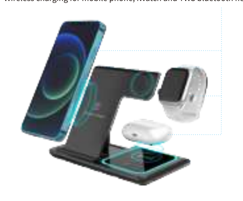
Wireless charging for mobile phone and TWS bluetooth headsets when the device is folded

Wireless charging for mobile phone, iWatch and TWS bluetooth headsets