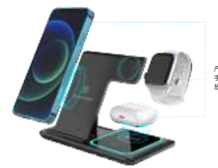
产品连接电源后, 手机、iWatch、蓝牙耳机 放下即可充电

3. 为手机、iWatch或蓝牙耳机等设备充电时,将手机、iWatch或蓝牙 耳机平放在充电区,0.1秒后,开始为设备充电;当充满电后,可以直 接取下设备;充电过程中,如果设备需要终止充电,可以直接取下。