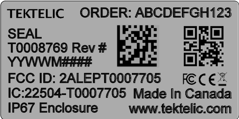
MODULE, SEAL, CLIP SAFETY