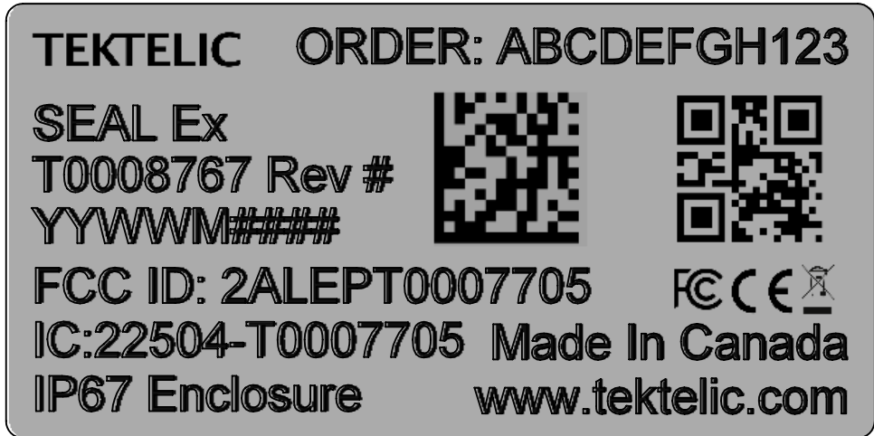
MODULE, SEAL Ex, CLIP SAFETY