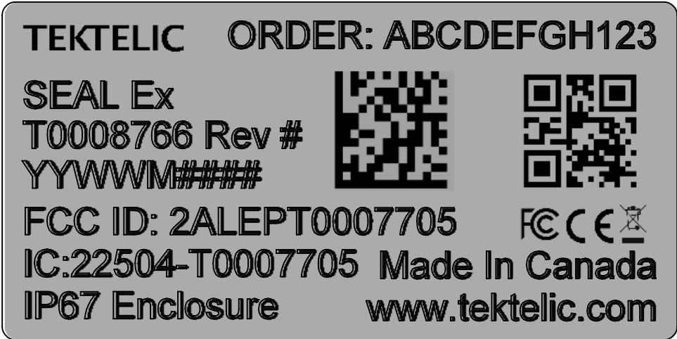
MODULE, SEAL Ex