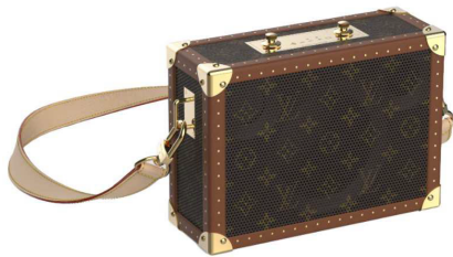
Host equipment with Antennas Clutch : Speaker Trunk PM