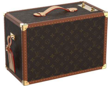
Host equipment with Antennas Home: Speaker Trunk GM