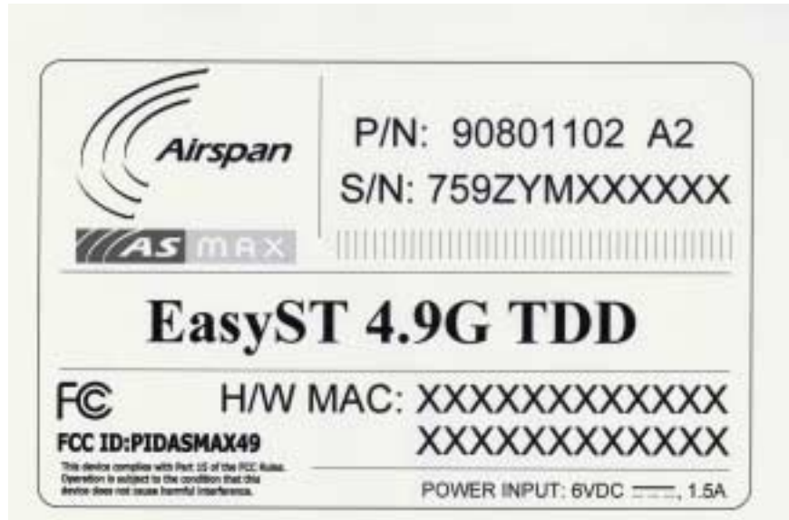
EasyST 4.9 GHz TDD bottom, label with FCC ID:PIDASMAX49 location

The label material is PVC with a permanent adhesive.