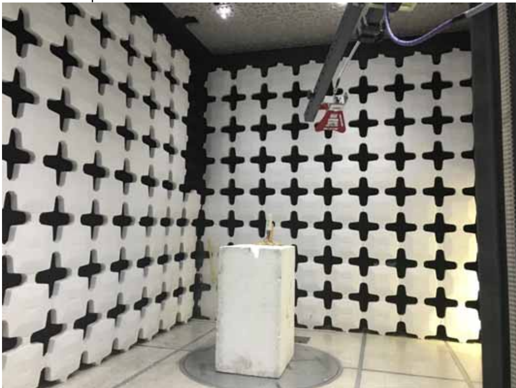
Test Setup for Radiated Emissions 1-18GHz – Vertical Polarization