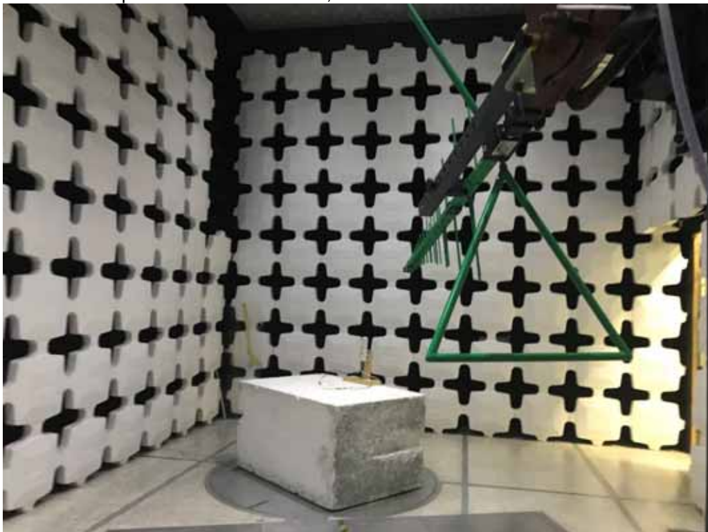
Test Setup for Radiated Emissions, 30MHz to 1GHz – Vertical Polarization