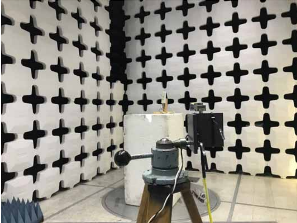
Test Setup for Radiated Emissions above 18-26GHz – Horizontal Polarization