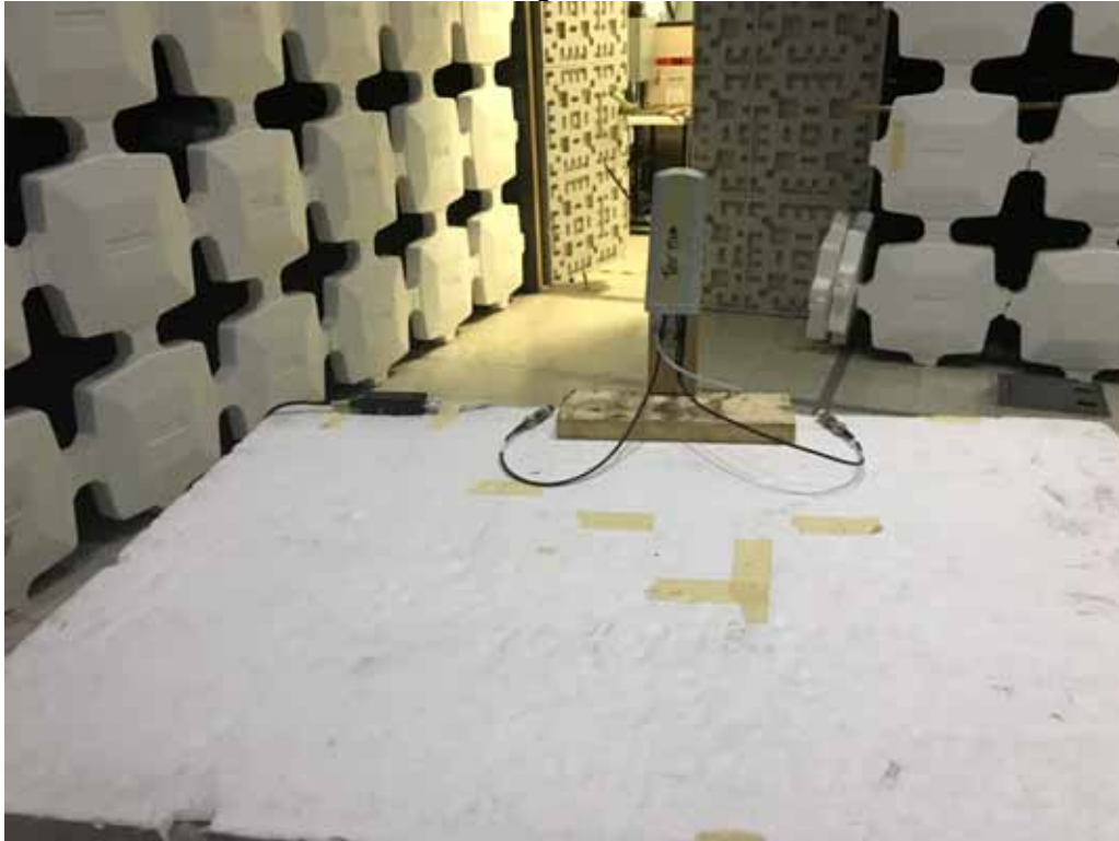
Photograph of the EUT