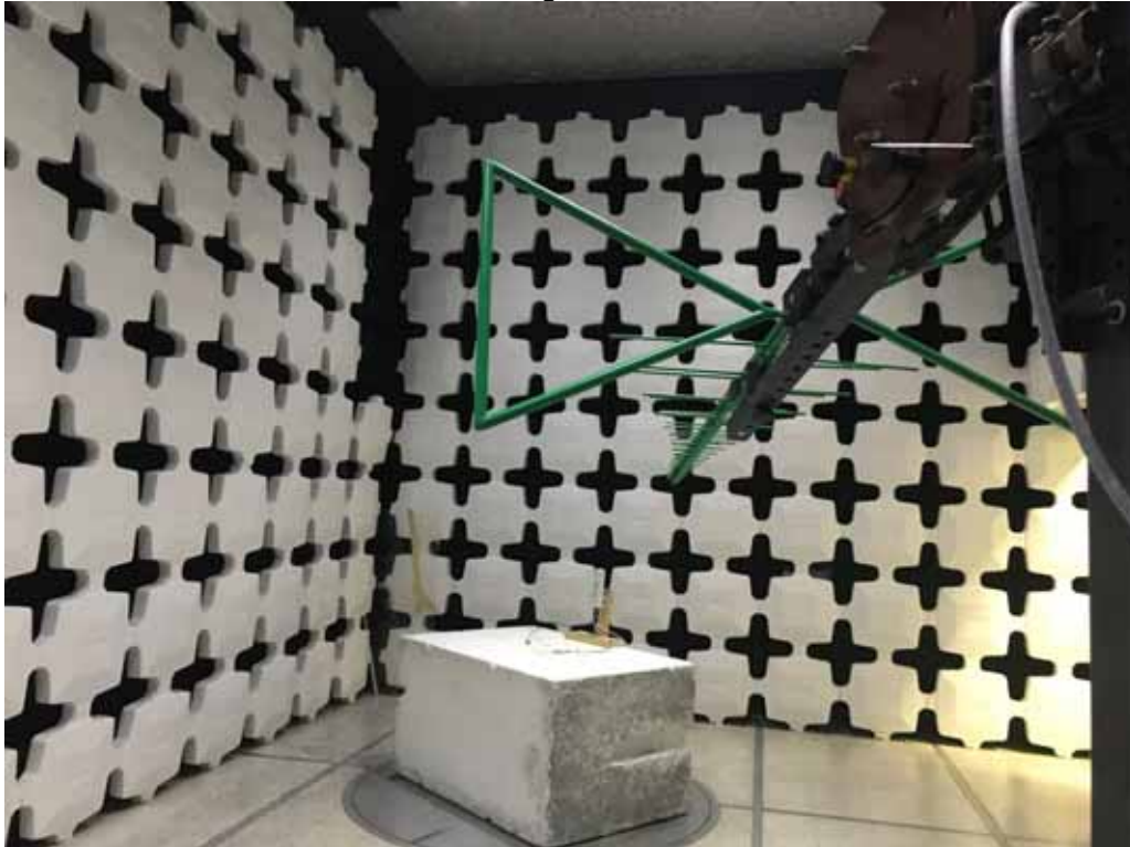
Test Setup for Radiated Emissions, 30MHz to 1GHz – Horizontal Polarization