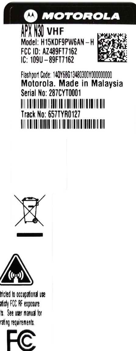
Figure 4: FCC/IC Label for APX N30 Hazloc