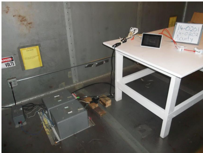
Photo 6- Conducted Emissions Test Setup

FCC Part 15.249/ RSS 210 14-0201 Acuity Brands Lighting 2ADCB-FCS7TSN 6715C-FCS7TSN September 3, 2014 FCS 7TSN