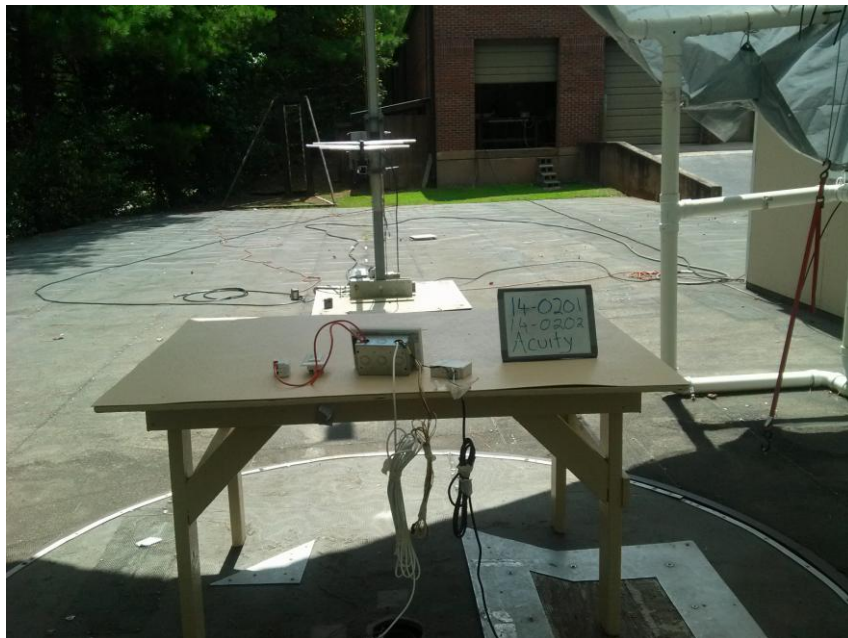
Photo 3- Radiated Emissions Test Setup, 200 MHz to 1000 MHz, Back

FCC Part 15.249/ RSS 210 14-0201 Acuity Brands Lighting 2ADCB-FCS7TSN 6715C-FCS7TSN September 3, 2014 FCS 7TSN