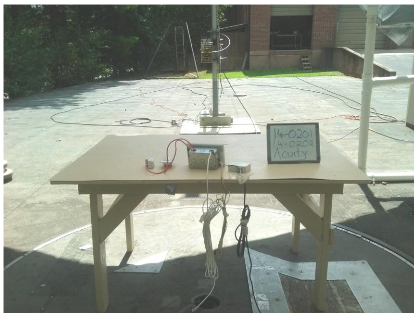
Photo 4- Radiated Emissions Test Setup, 1GHz and Above, Back