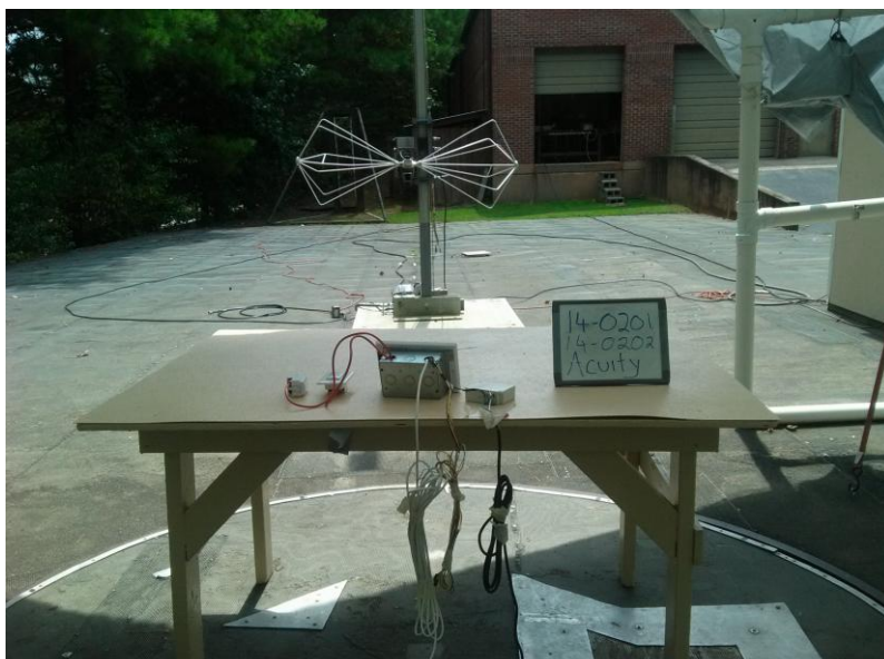
Photo 2- Radiated Emissions Test Setup, 30 MHz to 200 MHz, Back