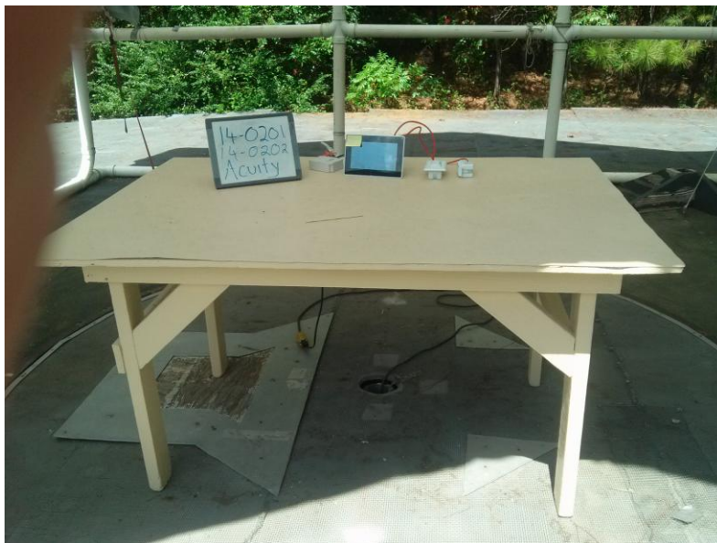
Photo 1- Radiated Emissions Test Setup, Front