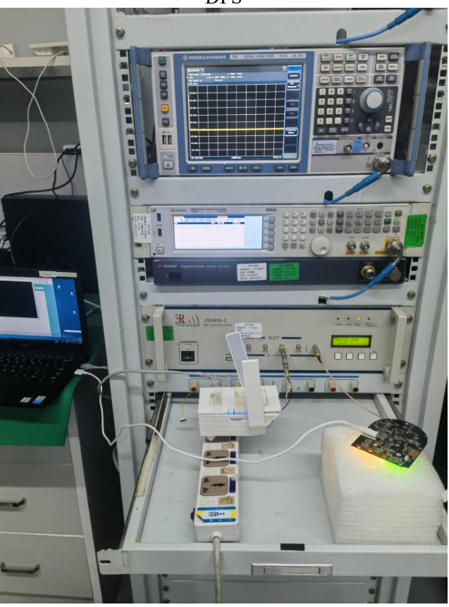
Page 3 of 3