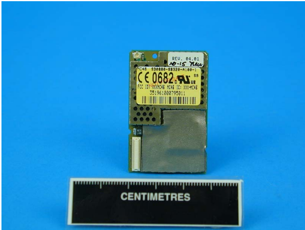
MC-46 GSM/GPRS Module – Top View – without Circuit Board