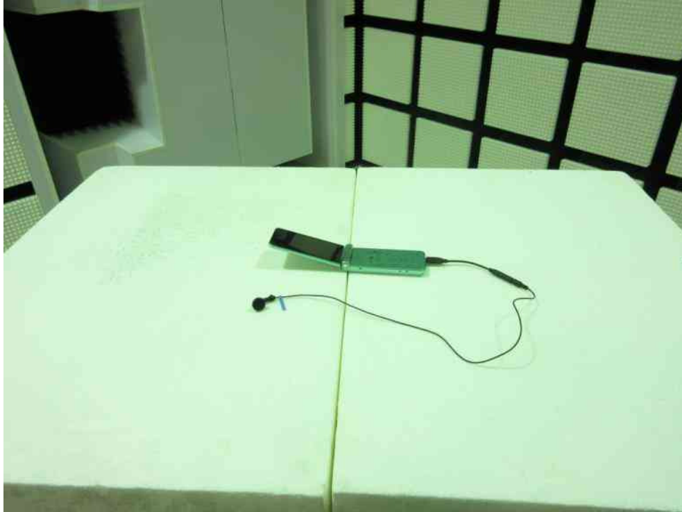
– X-axis –