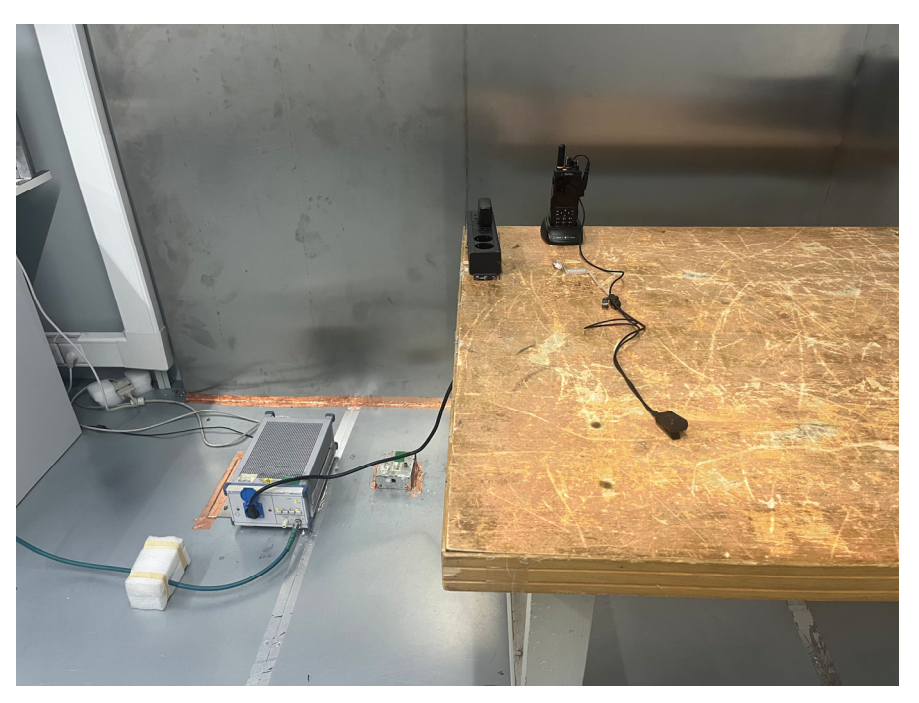
Conducted Emissions - Front View