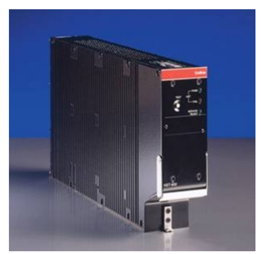
Figure 3 HST-21X0 Assembly