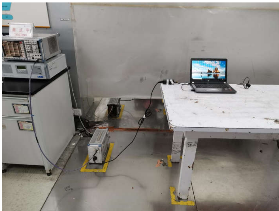
AC Conducted Emissions Test Setup