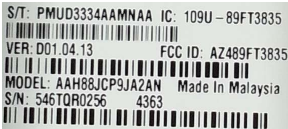
FCC/IC LABEL FOR DISPLAY MODEL (AAH88JCP9JA2AN)

X See the Attached Photograph and Exhibit 3C for the actual location of the FCC label on the device. ____ Label Attached Below. ____ See Attached Drawing.