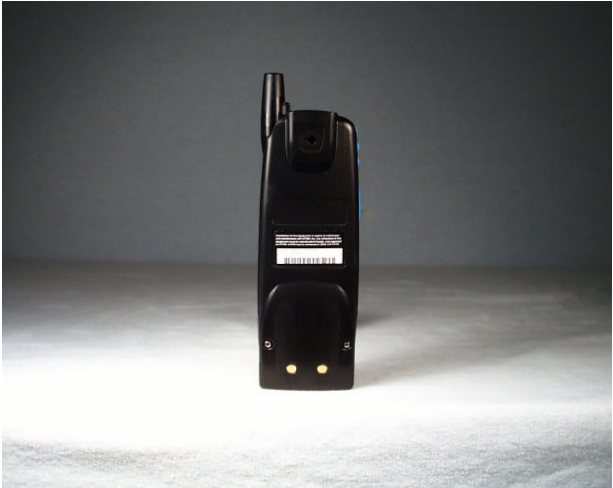
Photograph Showing Label Placement