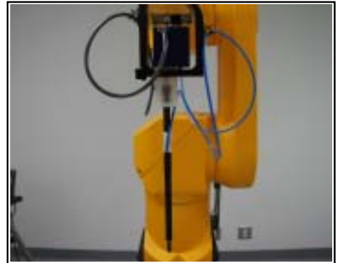
Photograph of the Probe

The SAR measurements were conducted with the dosimetric probe ET3DV6 designed in the classical triangular configuration and optimized for dosimetric evaluation. The probe is constructed using the thick film technique, with printed resistive lines on ceramic substrates. The probe is equipped with an optical multi-fiber line ending at the front of the probe tip. It is connected to the EOC box on the robot arm and provides an automatic detection of the phantom surface. Half of the fibers are connected to a pulsed infrared transmitter, the other half to a synchronized receiver. As the probe approaches the surface, the reflection from the surface produces a coupling from the transmitting to the receiving fibers. This reflection increases first during the approach, reaches maximum and then decreases. If the probe is flatly touching the surface, the coupling is zero. The distance of the coupling maximum to the surface is independent of the surface reflectivity and largely independent of the surface to probe angle. The DASY4 software reads the reflection during a software approach and looks for the maximum using a 2nd order fitting. The approach is stopped when reaching the maximum.