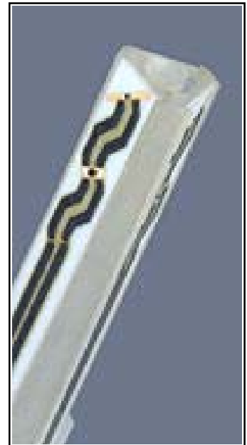
Inside View of ET3DV6 E-field Probe