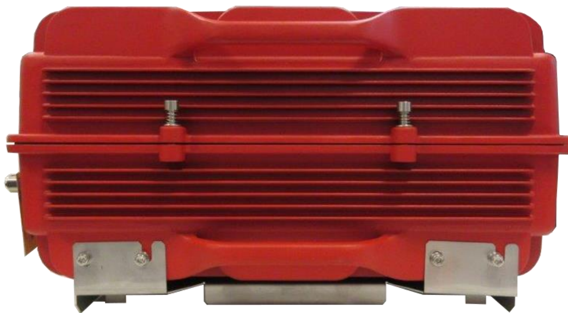
DHS40-R - Right Side View

Electromagnetic Devices for Radio Communications Systems