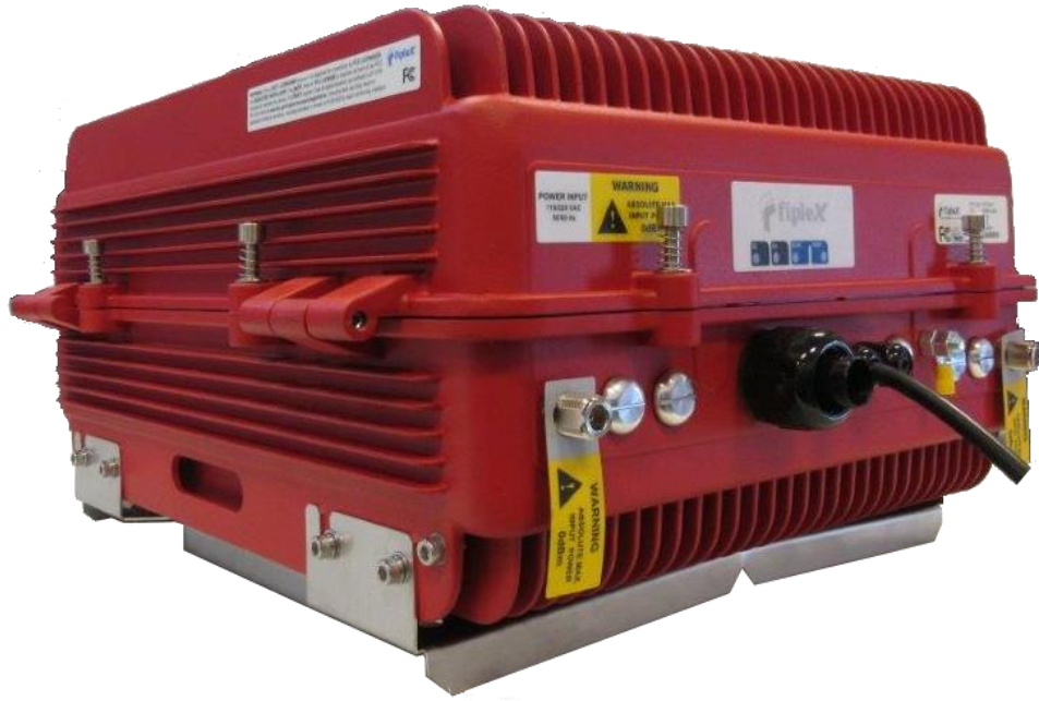
DHS40-R - Perspective

Electromagnetic Devices for Radio Communications Systems