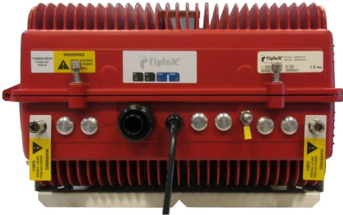
DHS40-R - Front View

Electromagnetic Devices for Radio Communications Systems