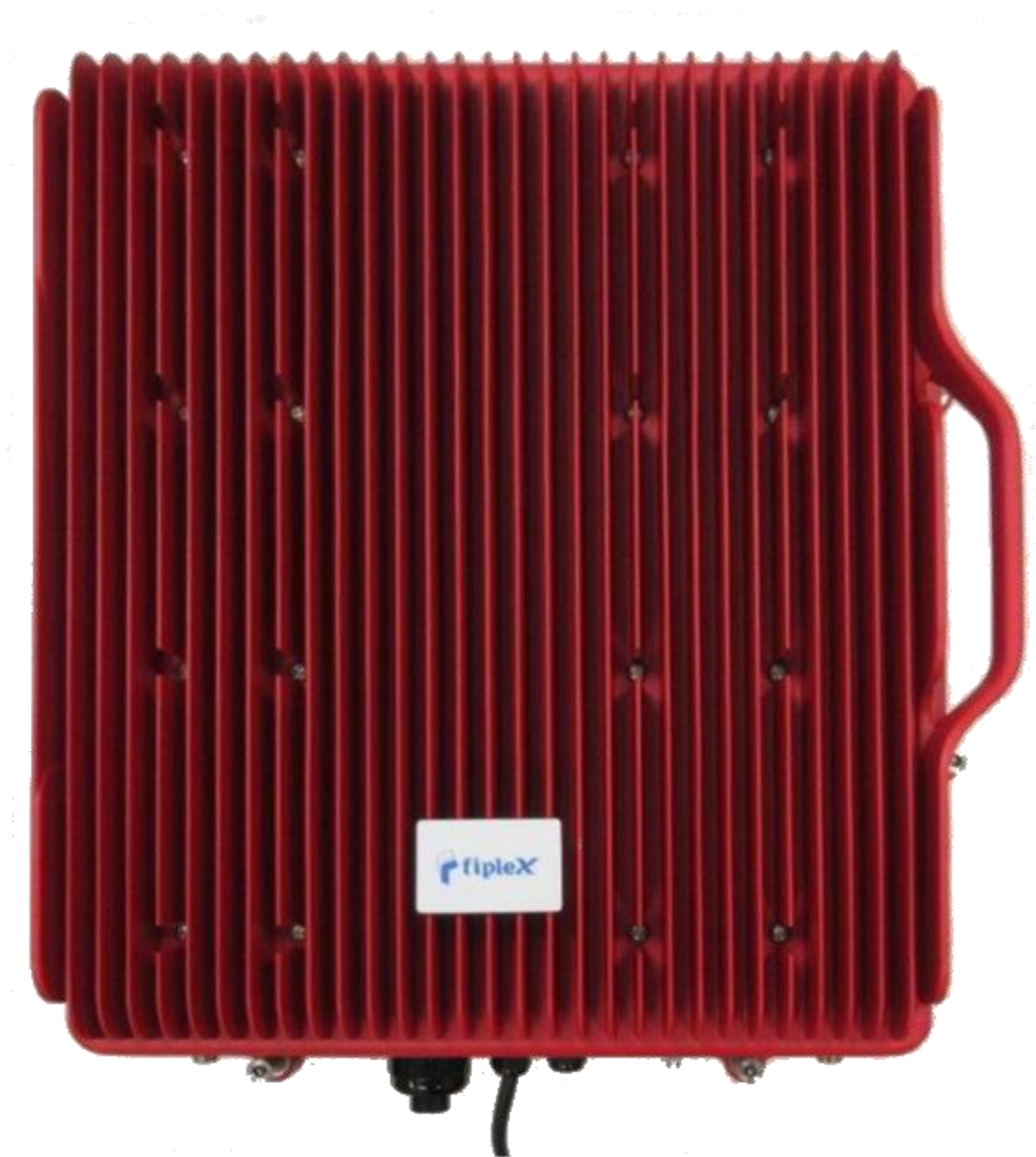
DHS40-R - Top View

Electromagnetic Devices for Radio Communications Systems