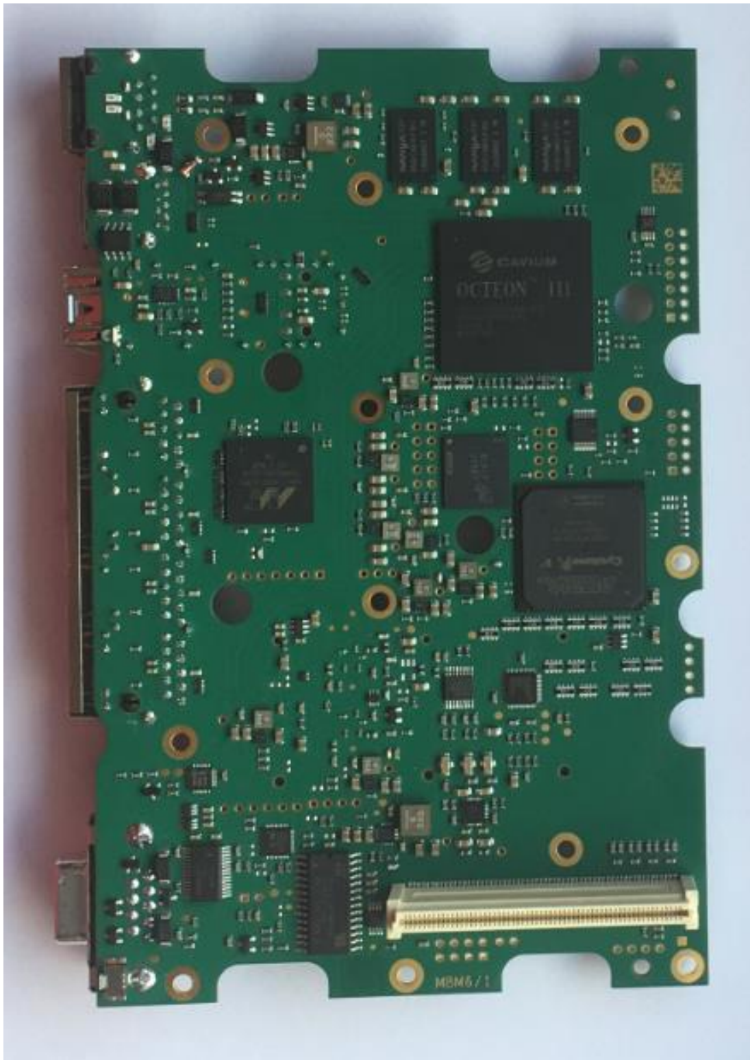
Logic Board, Top