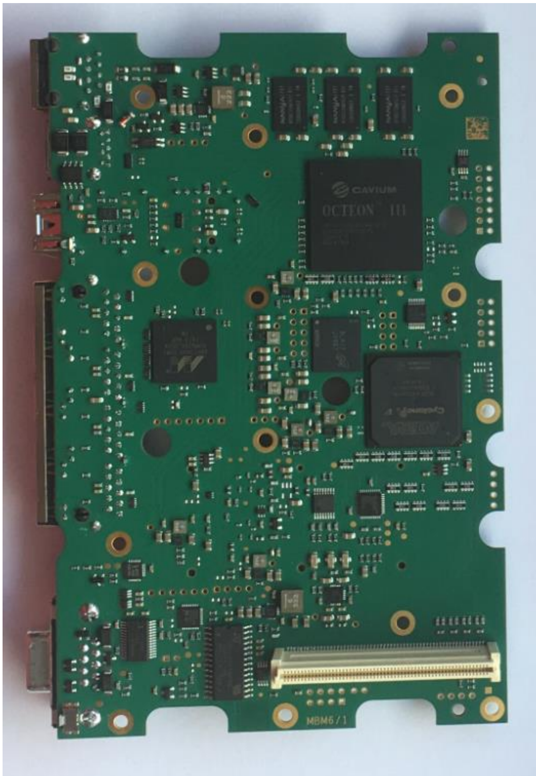
Logic board bottom