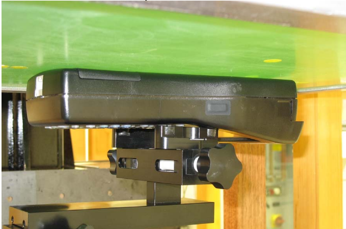
Body Worn Back Position