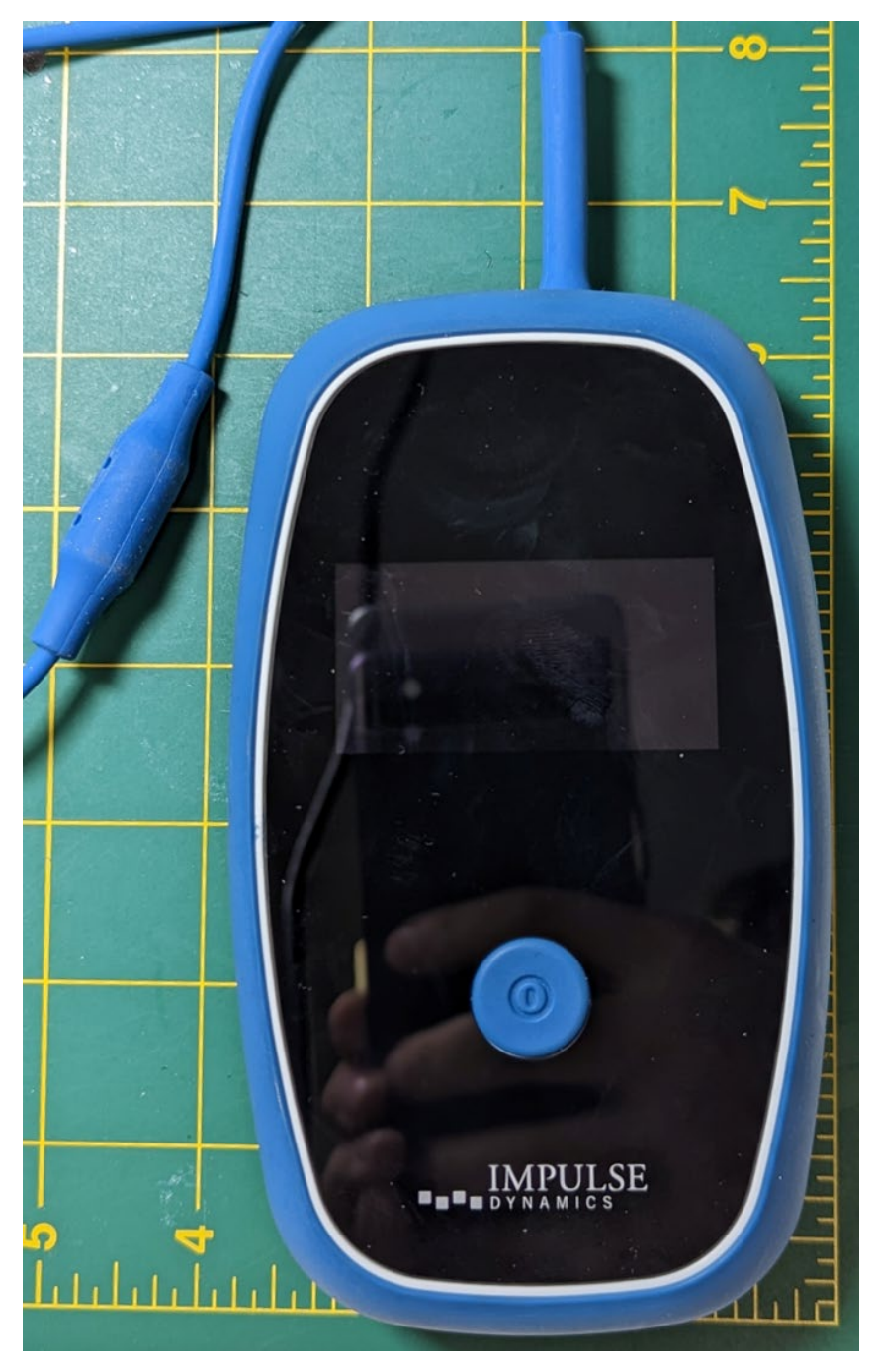
External Picture 3: Dimensions of the main enclosure