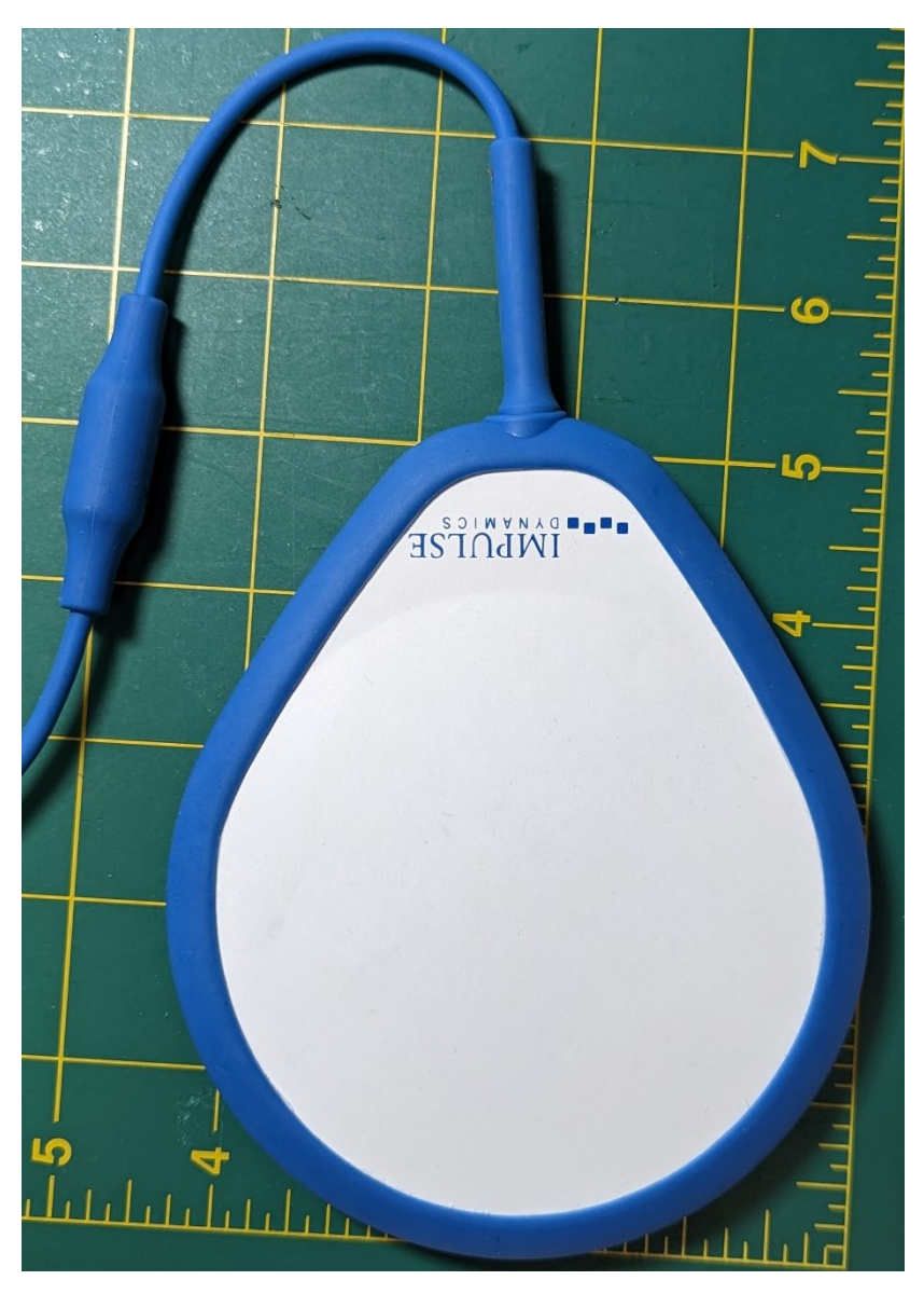
External Picture 4: Dimensions of the Charger Wand