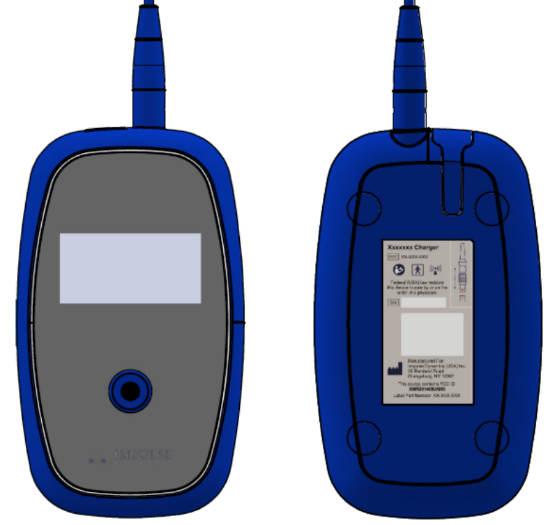
External Picture 2: Mechanical model used for assembly indicating label location