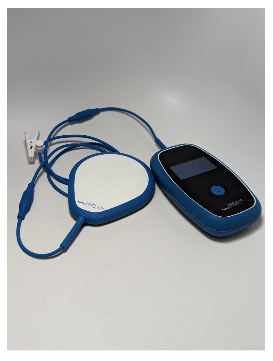
External Picture 1: Picture of the Guardio Charger