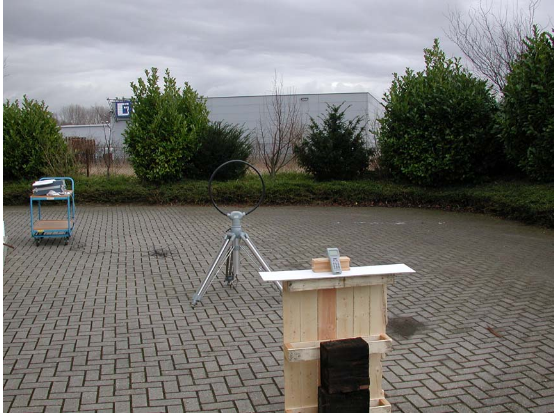
Radiated emission (magnetic loop)