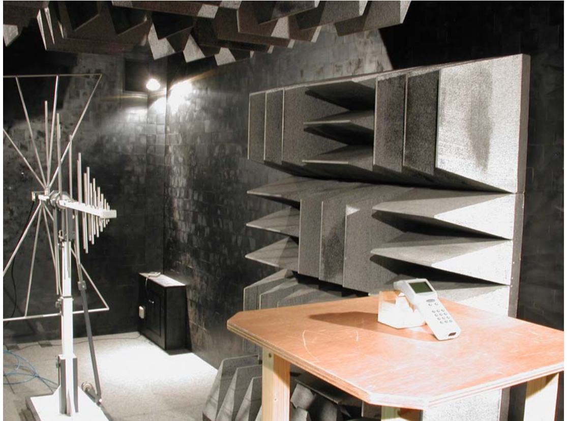
Radiated emission – pre-compliance measurement (ANEC)