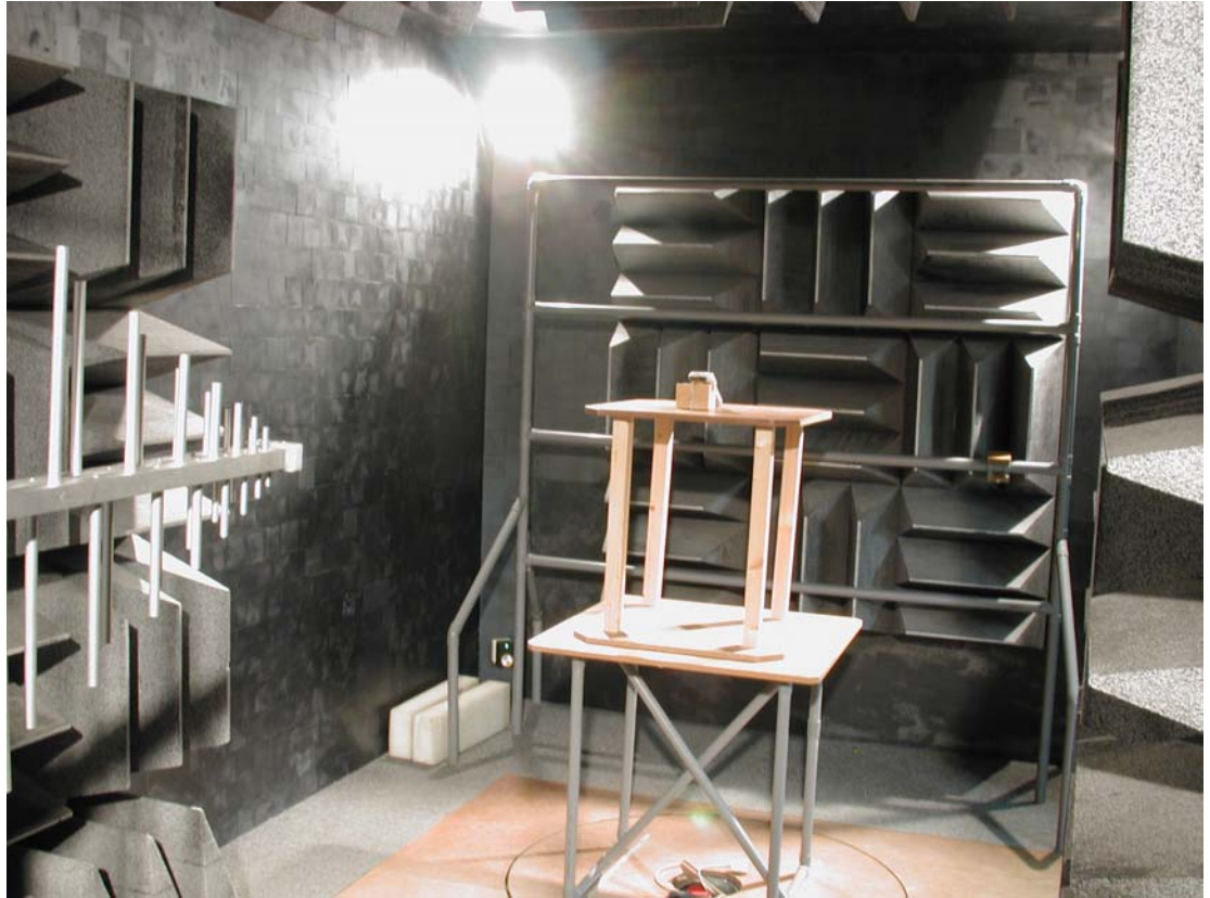
Radiated emission – pre-compliance measurement (ANEC)