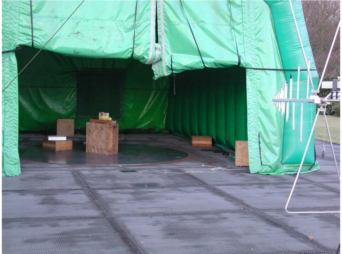
Radiated emission (OATS)