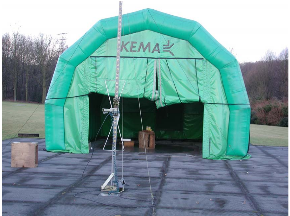
Radiated emission (OATS)