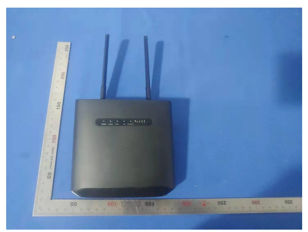
Front of the sample