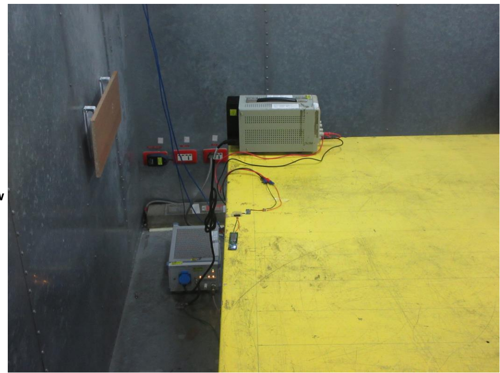
Under Table View